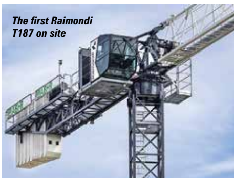
The first Raimondi T187 on site

Belgian construction company ABHR has taken delivery of the first Raimondi T187 flat-top tower crane. Launched at Bauma, the T187 has a maximum capacity of 10 tonnes and jib length of 67.5 metres with a jib tip capacity of 1.6 tonnes.