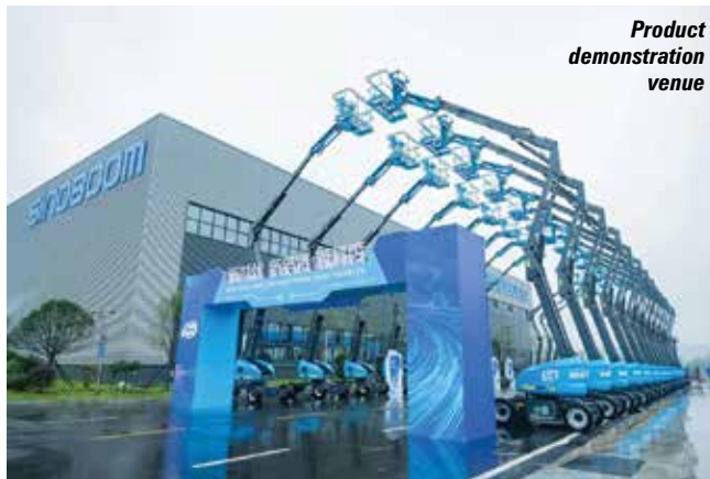
Product demonstration venue

The final new model is a classic 12ft mast type lift, the VM04E/VM12E, with a working height of 5.8 metres, a platform capacity of 227kg, direct electric drive, an overall length of 1.38 metres, an overall width of 780mm with an overall height of 1.6 metres while weighing 785kg. The new machine featured on the company's stand at APEX when it received an order for 200 units from Swedish sales and service company Liftab, all of which will apparently be delivered this year.