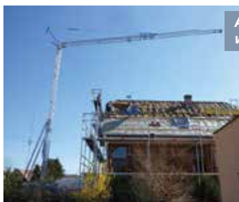
A MiDi LT14 at work... and on tow

The new company will focus on the Spanish manufacturer's three model LT range which all weigh less than 3.5 tonnes on the road. The line up includes the LT10, LT12 and LT14 with horizontal jib hook heights of 10, 12 and 14 metres respectively while 20 metres is possible on the LT14 with jib luffed. Maximum capacities are 400kg, 800kg/1,200kg and 1,500kg. The LT10 has a 10 metre jib, while the LT12 and LT14 have 14 metre jibs. Jib tip capacities are 300kg, 325kg and 350kg respectively.