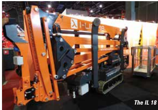
The IL 18

The IL 21 has a working height of 20.8 metres, an outreach of 11 metres at a seven metre up & over height, while the maximum up & over height is eight metres with an outreach of 10 metres. The unrestricted/maximum platform capacity is 230kg. Most equipment is standard including telematics and remote diagnostics, radio remote controls, outrigger cylinder covers, automatic 'home' self-centering boom stowage and simplified auto levelling.