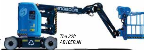
The 32ft AB10ERJN