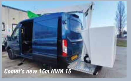
Comet's new 15m HVM 15

The company's UK dealer, Hydraulic Platform Services is helping develop the range which will also include 11 and 13 metre models. Features include in-cab stabiliser controls with illuminated switches to alert the operator if the jacks are stowed or set for work then changed over to platform operation once the stabiliser set lights are on.