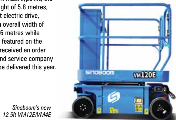
Sinoboom's new 12.5ft VM12E/VM4E