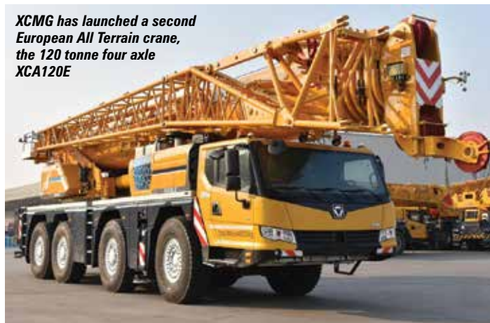
XCMG has launched a second European All Terrain crane, the 120 tonne four axle XCA120E

An MTU diesel drives a 12 forward, two reverse speed ZF 12 TraXon transmission, with the three rear axles all driven, while all wheel steering is standard as is a retarder. The independent suspension system is similar in overall concept to that used by Grove. The overall width is 2.75 metres, depending on tyres, while the overall length is just over 14.3 metres. The outriggers have five working widths from fully retracted to seven metres. Maximum counterweight is 33 tonnes.