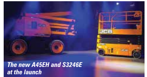
The new A45EH and S3246E at the launch