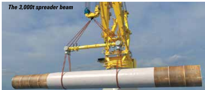
The 3,000t spreader beam

The spreader beam will be used to lift monopiles for the largest offshore wind turbine foundations, and be used with Jan De Nul's 3,000 tonne Huisman Leg encircling crane onboard the Voltaire offshore jack-up installation vessel, and the new 5,000 tonne Huisman tub mounted crane on the Les Alizés heavy lift vessel, which will transport and install 107 monopile foundations and an offshore substation topside for Ørsted's Gode Wind 3 and Borkum Riffgrund 3 offshore wind farms in Germany.