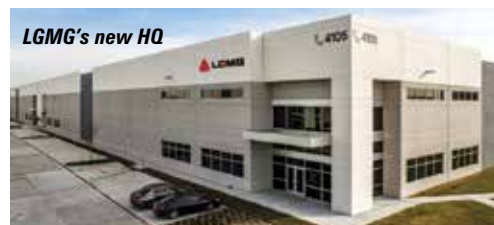
LGMG's new HQ

LGMG has relocated its North American headquarters to a brand new facility on the north side of Dallas, Texas. The new premises includes offices, a warehouse, meeting rooms and a training centre. It will stock replacement parts and new machines ready for fast delivery and will also feature a showroom of products marketed by the company in North America.