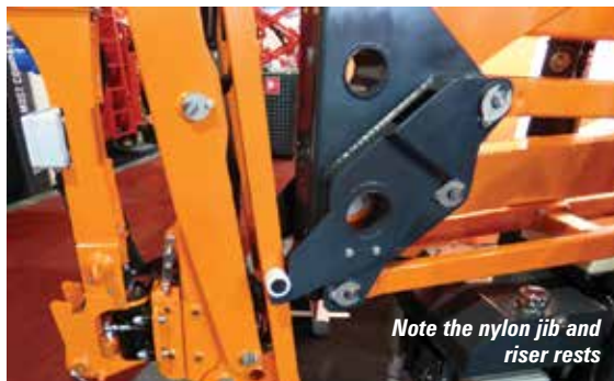
Note the nylon jib and riser rests