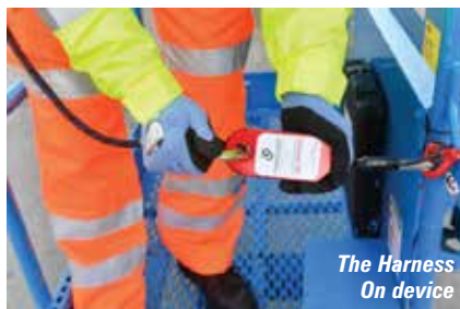
The Harness On device

The company is making the device available to any company that is interested in installing it. It hopes to have 6,000 booms equipped with the device by the end of the year.