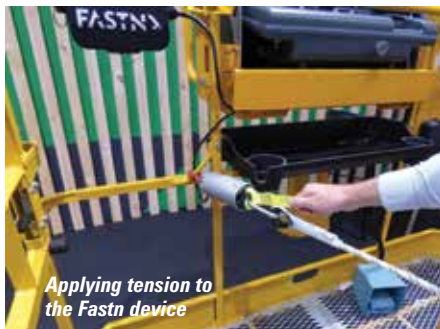
Applying tension to the Fastn device

However only one anchor point can be equipped with the system, Haulotte says that it is the responsibility of the person in charge of the controls to ensure that anyone else in the platform is also fully harnessed and attached to the other anchor points.