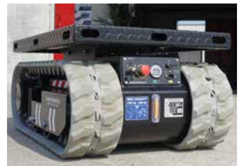
The 1.5 tonne all-electric carrier

The carrier features two 5.3kW AC electric two speed direct drive track motors, the transport deck is steel checker plate and can be slid forward to provide easy access to the components. Power is supplied by a 55Ah maintenance free AGM battery pack, with an integrated onboard charger that takes the batteries from empty to fully charged in six hours. An Autec radio remote controller is standard.