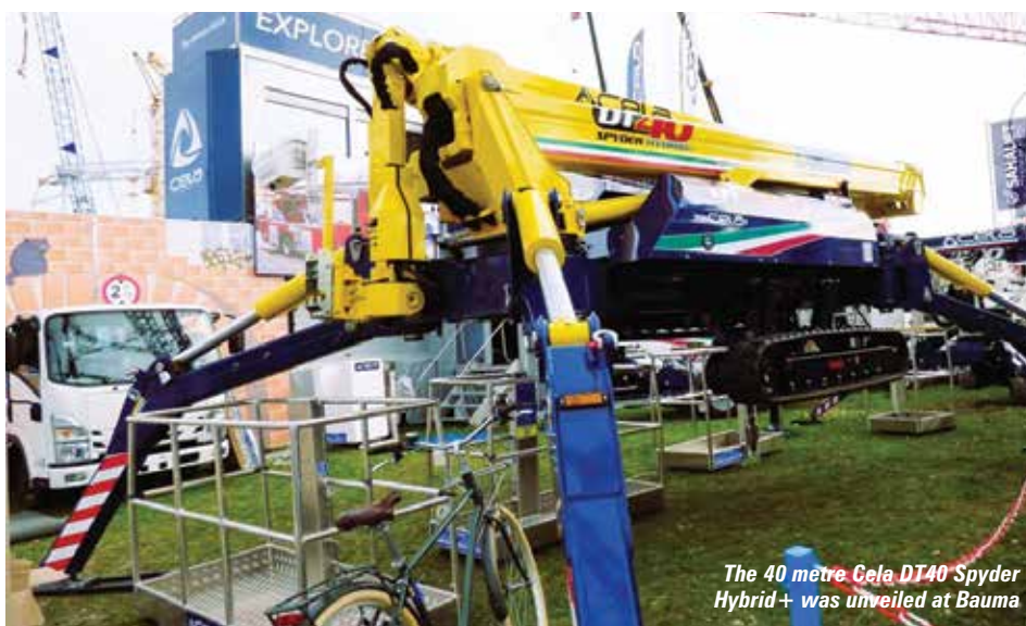
The 40 metre Cela DT40 Spyder Hybrid+ was unveiled at Bauma