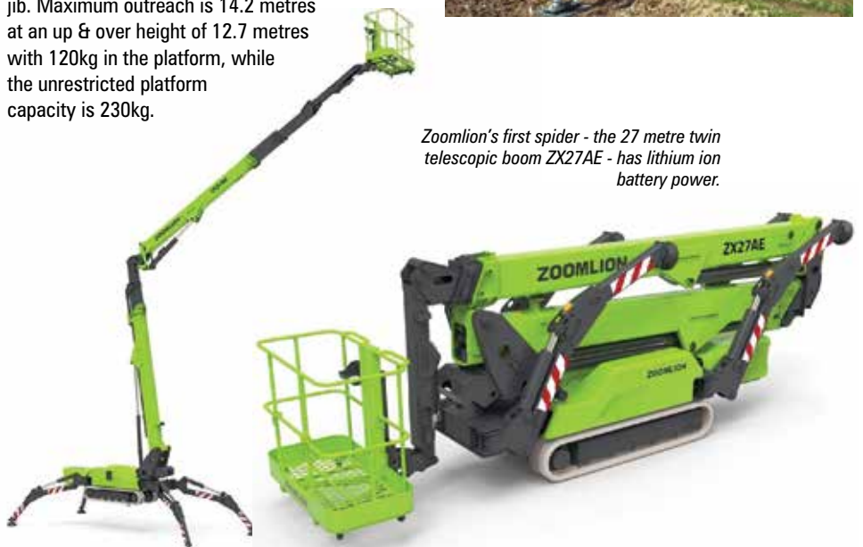
Zoomlion's first spider - the 27 metre twin telescopic boom ZX27AE - has lithium ion battery power.

Zoomlion has produced its first spider lift, the 27 metre twin telescopic boom ZX27AE with lithium ion battery power. The company announced the new model in China early in the new year with the first unit delivered to Jiangxi Railway station in Jiangxi between Shanghai and Hong Kong in May. The new machine has a three section lower telescopic boom with an over centre linkage to a three section top boom and articulating jib. Maximum outreach is 14.2 metres at an up & over height of 12.7 metres with 120kg in the platform, while the unrestricted platform capacity is 230kg.