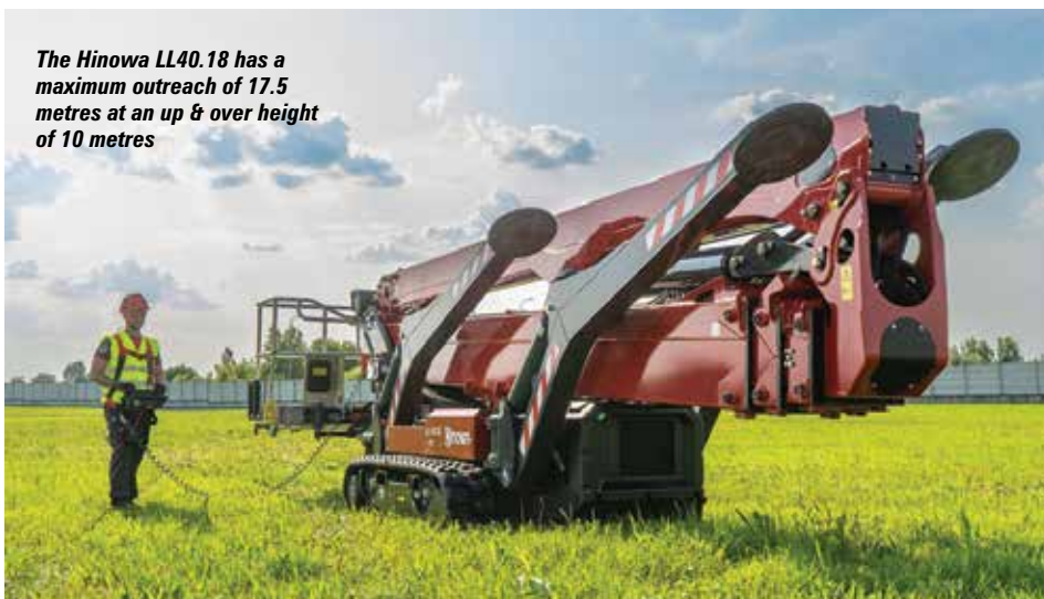
The Hinowa LL40.18 has a maximum outreach of 17.5 metres at an up & over height of 10 metres

The 40 metre Cela DT40/DT131 Spyder Hybrid+ was also unveiled at Bauma and takes over from the 37 metre DT37 at the top of the company's spider lift line. The new hybrid spider lift is powered by either diesel coupled with a heated lithium battery pack for dual power. When compared with Hinowa's LL40.18 it has slightly less outreach and is physically slightly larger, although it weighs less at 8,000kg.