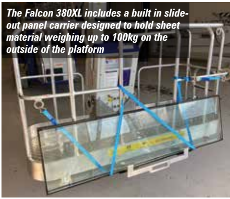
The Falcon 380XL includes a built in slide-out panel carrier designed to hold sheet material weighing up to 100kg on the outside of the platform

suitable for lifting glass and solar panels, plywood and other materials.