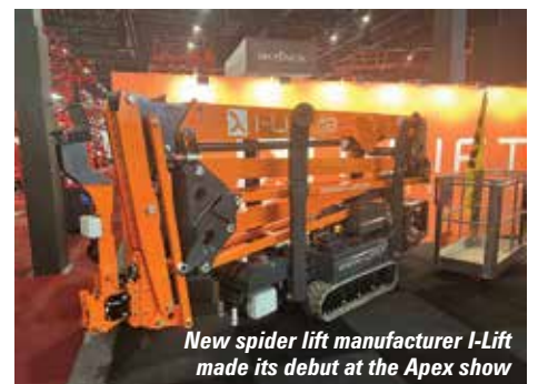
New spider lift manufacturer I-Lift made its debut at the Apex show

height IL16 is the most compact on the market measuring 4.5 metres long (3.8m without the basket), 780mm wide without the basket and 1.99 metre high. Maximum outreach is 7.7 metres with 230kg unrestricted maximum load. Smallest lift is now the 13 metre IL13 which has a 7.5 metre outreach, 200kg maximum load and weighs 1,660kg.