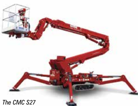
The CMC S27