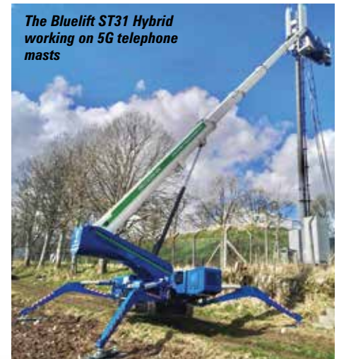
The Bluelift ST31 Hybrid working on 5G telephone masts

And finally Platform Basket has been refining its products which are now all available with Hybrid power. The Spider 33.15 now has an increased load capacity of 300kg and the Spider 20.95 has an unrestricted 250kg. Both are also available with a winch which replaces the platform. ■