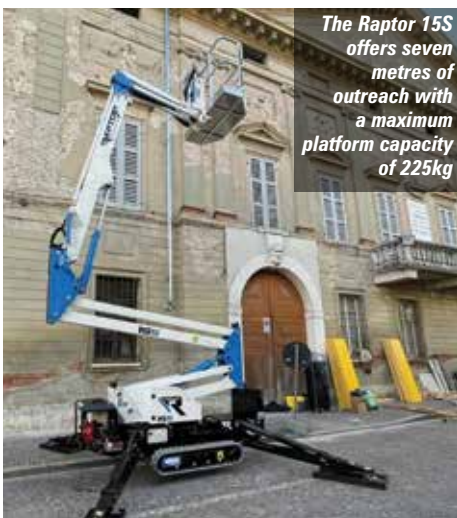
The Raptor 15S offers seven metres of outreach with a maximum platform capacity of 225kg

At the end of last year Italian manufacturer Socage announced a new company with a new range of spider lifts, Raptor. The Raptor company or division has a different ownership mix to the initial truck mounted lift business. The first three models have been announced and include the 15 metre Raptor 15S, 18 metre Raptor 18S and 21 metre Raptor 21S.