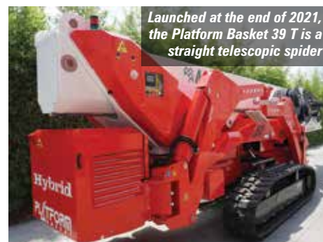
Launched at the end of 2021, the Platform Basket 39 T is a straight telescopic spider