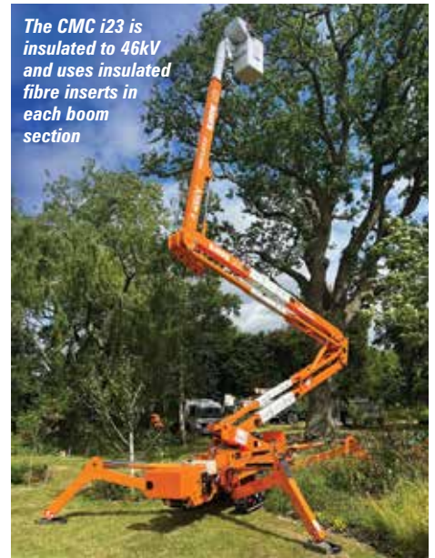
The CMC i23 is insulated to 46kV and uses insulated fibre inserts in each boom section