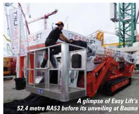
A glimpse of Easy Lift's 52.4 metre RA53 before its unveiling at Bauma