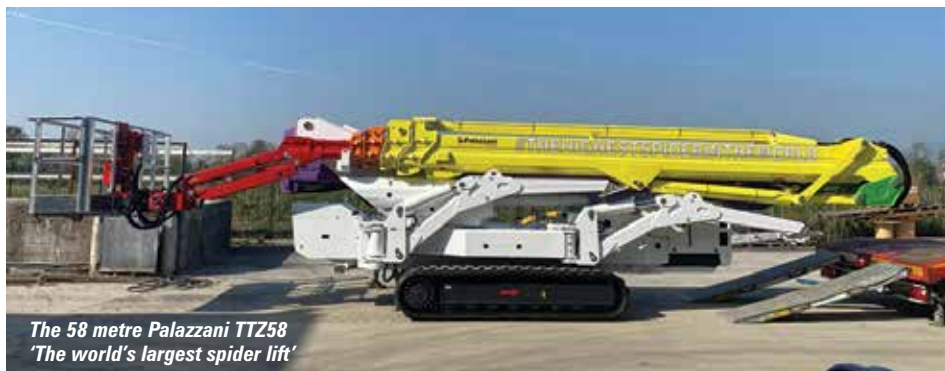
The 58 metre Palazzani TTZJ58 'The world's largest spider lift'

Palazzani also launched its wheeled or tracked Eco Ragno TSJ 35.1 with power options including Bi-energy - diesel and AC - or Eco with AC and lithium battery. The unit has a 35 metre working height, 15 metres with 230kg of outreach courtesy of its Strenx steel telescopic boom and articulated jib. Overall height is two metres in transport configuration.