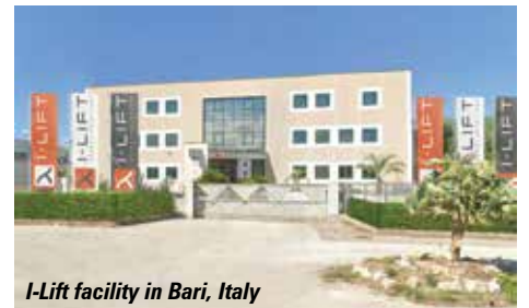
I-Lift facility in Bari, Italy

The company claims its latest 15.7 metre working