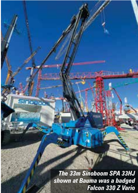
The 33m Sinoboom SPA 33HJ shown at Bauma was a badged Falcon 330 Z Vario

The i23 has a working height of 22.8 metres, a maximum outreach of 10 metres at an up & over