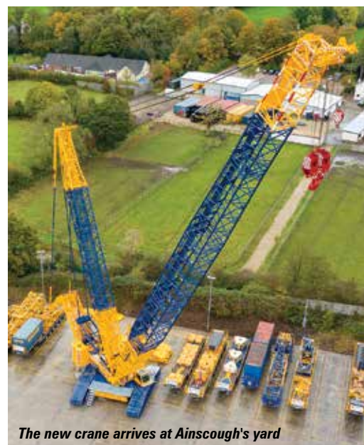
The new crane arrives at Ainscough's yard

The purchase is aimed at expanding the company's activities and coverage of the heavy lift and major project market. Ainscough runs the UK's largest mobile crane fleet - 392 cranes operating from 28 locations with more than 850 staff - but is not among the top 10 crawler crane fleets.