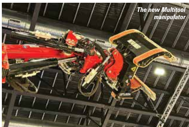
The new Multitool manipulator