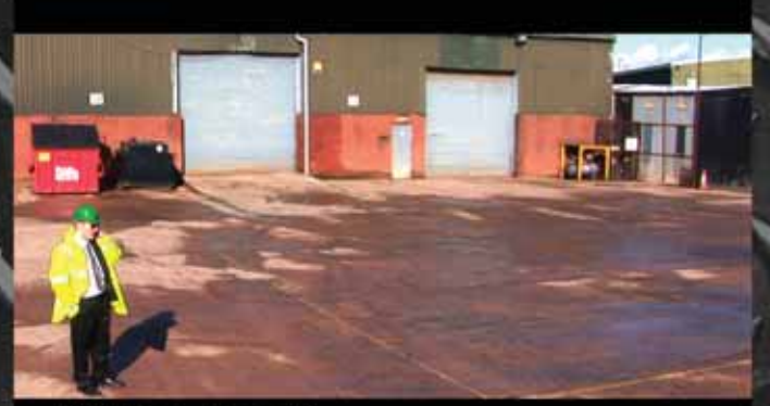
Morning, I need a ...