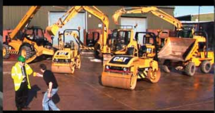
Your kit Sir and the cup of tea you ordered.