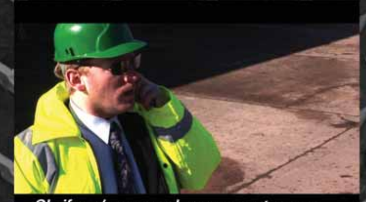
Ok, if you're so good, can you get me a...