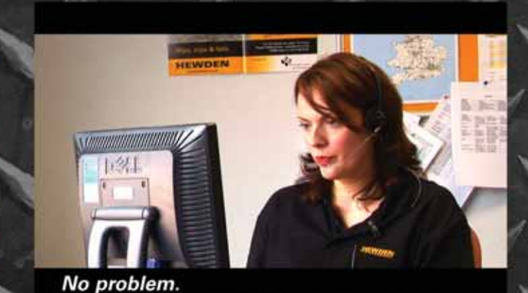
Thanks, but I also need a ...