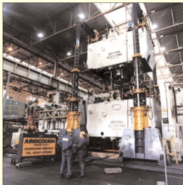
Ainscough recently helped car giant Jaguar at Halewood in Merseyside with a refurbishment programme. Part of this work involved the exchange of 120 tonne press crowns. Ainscough used the 900 series Lift'n'Lock octagonal boom gantry which made light work of the lift. The accurate positioning of the column keyways was made possible utilising the system's 12 metre lifting height and unique side shift facility.

summer following financial difficulties, could be broken up and sold piece by piece this side of the calendar year. "We have had discussions with a prospective purchaser, but things are going much more slowly than we hoped," he added.