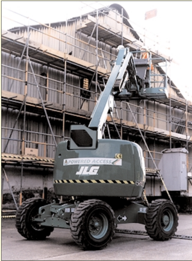
A-Plant has hired out a total of 11 scissor lifts and access booms, including the new 450AJ Articulating Boom Lifts from JLG to the Rail Division of Fitzpatrick in a £6 million rail contract in South London