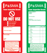
The proper use of the PASMA inspection records satisfies Work at height regulations

Work is now well advanced on the production of an 'Action Checklist' for mobile access towers in the form of a new Pocket Card intended to be used in conjunction with PASMA's Tower Inspection Record, as a reference checklist for the inspection of towers. The Pocket Card layout will subsequently be converted into the second of a series of PASMA posters.