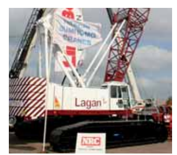
The Hitachi Sumitomo SCX15000-2 made its UK launch.