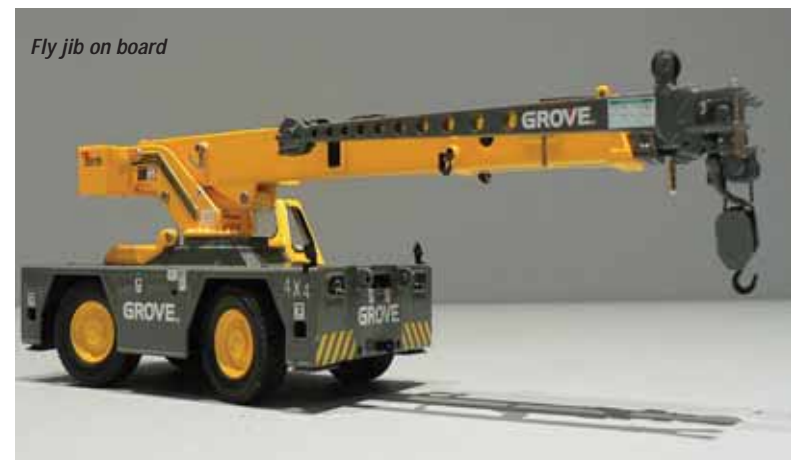
Fly jib on board