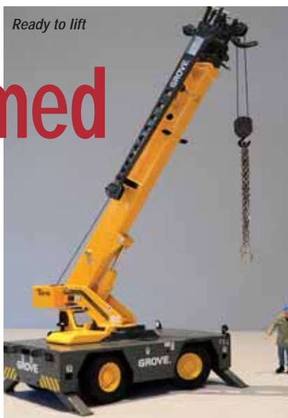
Ready to lift

To read the full review of this model visit www.cranesetc.co.uk