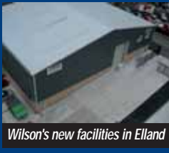
Wilson's new facilities in Elland

Leeds-based truck mounted platform rental company Wilson Access has moved from its old Brighthouse location to new premises in Elland in order to accommodate its new spider lift activity.