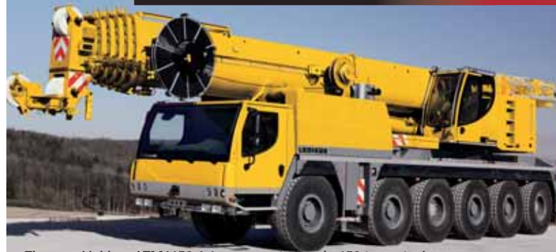
The new Liebherr LTM1150-6.1 a compact six axle 150 tonne taxi crane