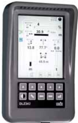
The DLZ 342 in-cab display.

Tower crane anti-collision company, SMIE has introduced a new in-cab load and zone display unit designed primarily to keep operators of stand alone cranes constantly informed of critical conditions, while incorporating an advanced data logger, keeping a constant log of the cranes operations. In the event of an accident at least the past 10 lift cycles will be fully recorded. The DLZ342 also allows for setting of specific zoning and records crane operations and where appropriate colour coding and sound alarms help warn when approaching a critical condition.