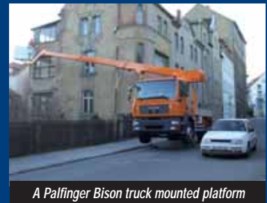
A Palfinger Bison truck mounted platform

Palfinger Bison has extended its H-Line option on its truck mounted aerial lift that permits full outreach within the vehicle width (down only outrigger jacking) up to its 30 metre models.