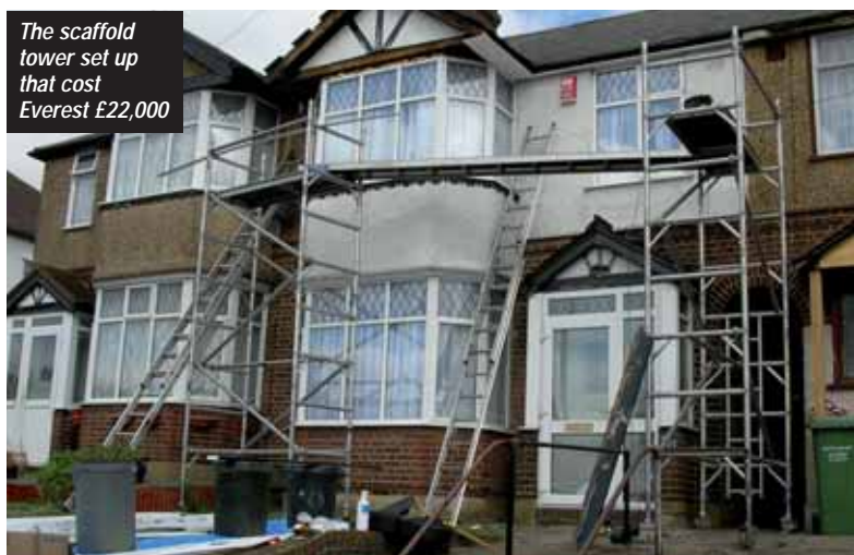
The scaffold tower set up that cost Everest £22,000

HSE Inspector, Norman Macritchie said: "The challenge for the construction industry is to ensure that sensible and effective precautions are in place to stem these deaths."