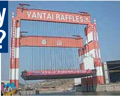
The Taisun, the world's largest crane lifts a 20,133 tonne barge 30 metres above the water.

Yantai Raffles Shipyard, the largest builder of semi-submersible drilling rigs in China has 'christened' the world's first fixed dual-beam gantry crane. Named 'Taisun' after a sacred mountain in China's Shandong Province to reflect its size and strength, the crane has a maximum capacity of more than 20,000 tonnes. More than 600 guests from all over the world attended the event at