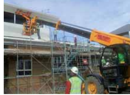
An Oktopus suction device fitted to a telehandler.