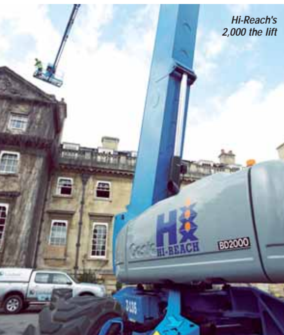
Hi-Reach's 2,000th lift

Hi-Reach Access, the Swindon-based aerial lift rental company has taken delivery of its 2,000th aerial work platform - a 41 metre Genie Z135/70 self propelled boom lift - part of a recent order for 60 Genie boom lifts. The latest delivery is one of 12 big booms in the order which will take the Hi-Reach fleet of boom lifts of more than 40 metres to 50 units, placing it among Europe's largest big boom fleets.