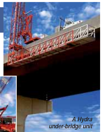
A Hydra under-bridge unit

93 percent of bridges in the United States were built before 1980 and 25 percent have been designated as structurally deficient or functionally obsolete. It is an excellent strategic fit since Bid-Well serves the same customer base and through which we hope to expand Hydra's national and international reach."