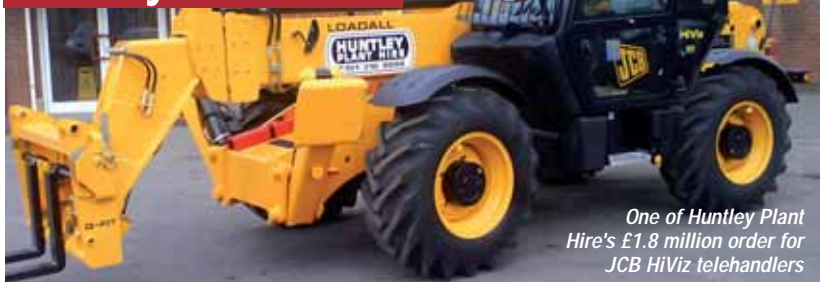
One of Huntley Plant Hire's £1.8 million order for JCB HiViz telehandlers

Newcastle-based access and telehandler rental company Huntley Plant Hire has placed a £1.8 million order with JCB for a number of its HiViz telehandlers. The order includes machines from five metres up to 17 metre lift heights, but the majority consists of 12 and 14 metre 535-125 and 535-140 HiViz models.