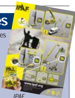
IPAF categories poster

Details on the new categories and frequently asked questions are available at the Training section of www.ipaf.org