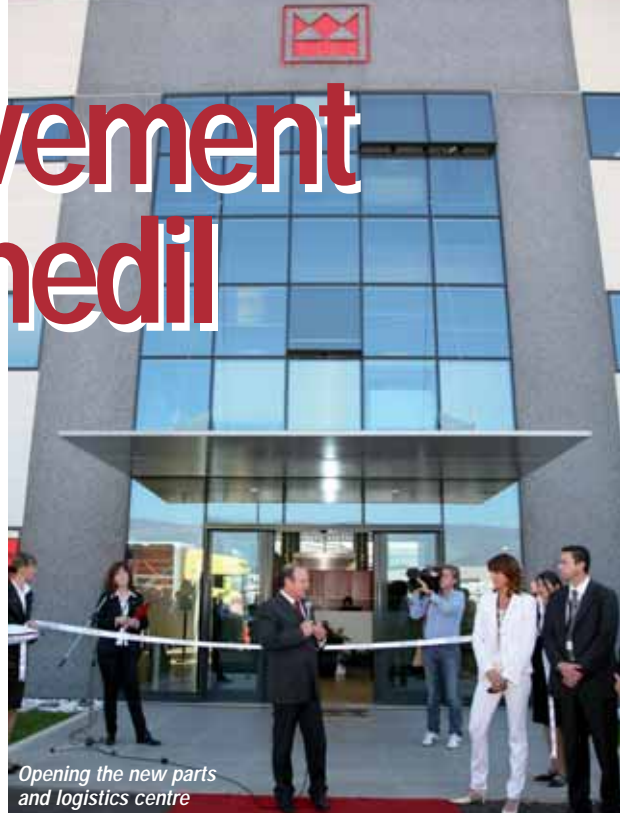
Opening the new parts and logistics centre

Electronics include a new touchscreen with graphical interface and new Integrated Control System (ICS) software aimed at increasing the ease, speed and precision of operation.