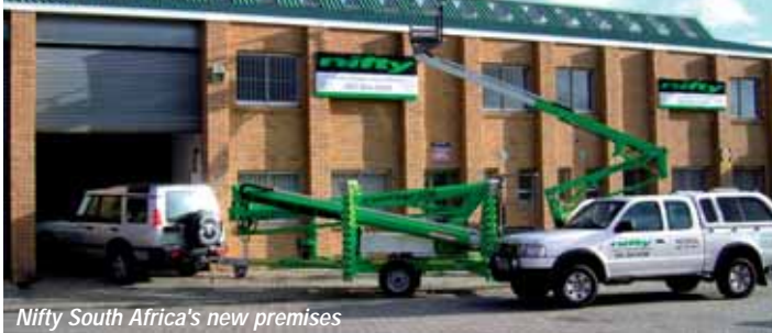
Nifty South Africa's new premises