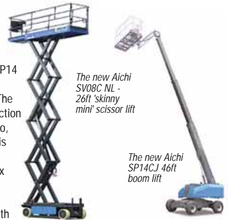
The new Aichi SV08C NL - 26ft 'skinny mini' scissor lift

the 2.4 metre (8ft) basket. Aichi says that the overall height of the new booms is close to two metres, while most lifts in this class are over 2.3 metres high. Doornbos, the Dutch crane and access rental company has purchased the first 400 scissors and 200 booms. The new models will be officially launched at the ARA/Rental show in mid February. No mention has been made regarding the planned articulating boom range.