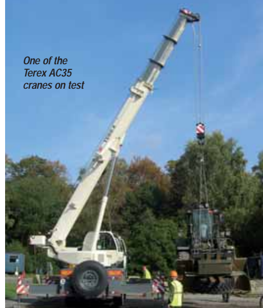
One of the Terex AC35 cranes on test

ALC quickly identified the need to replace, increase lifting capacity, modernise and rationalise the existing MoD mobile crane fleet as well as avoiding custom-designed, over-specialised products. With this in mind Terex-Demag offered its AC35 and AC55-1 models keeping optional non-standard equipment to a bare minimum. Terex Cranes France will produce the machines on a special dedicated production line in order to avoid any delays to the company's regular commercial business.