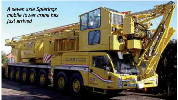
A seven axle Spierings mobile tower crane has just arrived

The first units of the order have started to arrive with deliveries continuing until 2010.