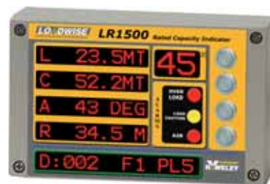
The Loadwise LR1500 console

ancillaries. Separate models are available for wind speed, weight, radius and angle only. The top of the range LR1500 will be unveiled at Conexpo.