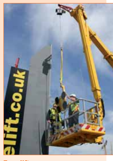
Bronto fitted with a very clever mini-jib/searcher hook fitted to the main boom at SED.

Irish-based Mantis Cranes appoints US dealer.