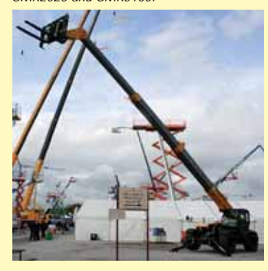
Haulotte had its new 14 metre telehandler on show. The new unit turned quite a few heads, although the preference was for the all black colour scheme seen at Bauma.