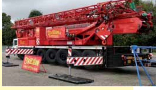
City Lifting showed off its brand new seven axle Spierings mobile self erecting tower crane. With a lifting capacity at height and long radius equal to a 300 tonne plus telescopic, the crane is ideally suited to congested city work. It also had one of its Comansa flat top city tower cranes on display. The unit offers a real alternative to folding self erectors.