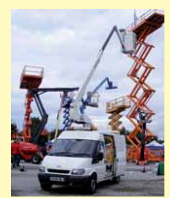
Another all new lift launched at Vertikal Days came from Allan Access. The new van mount has more than 12 metres working height, 12 metres outreach and requires no outriggers yet has a cargo carrying capacity of 450kg.