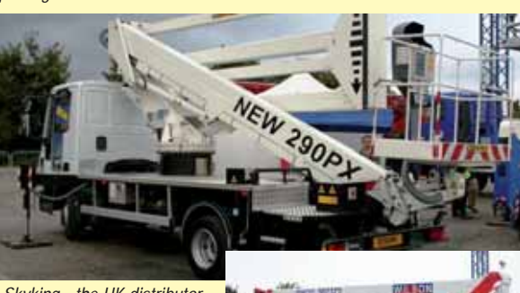
Skyking - the UK distributor for GSR and Wumag truck mounted lifts and Bluelift spider lifts - had a range of product including the 45 metre WT450 from Wumag in Wilson Access colours,