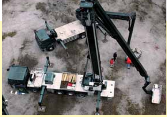
The UK's largest truck mounted lift the 90 metre Bronto S90HLA also made an appearance on the Thursday. Owned by Zenith platforms the machine was one of three large Bronto truck mounts on display.