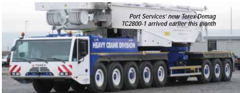
Port Services' new Terex-Demag TC2800-1 arrived earlier this month

All at a cost of £4.7 million. Its first Job is scheduled for the first week of December, when it will lift 250 tonne umbilical reels for a major offshore contractor in Aberdeen.