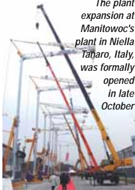
The plant expansion at Manitowoc's plant in Niella Tanaro, Italy, was formally opened in late October

Other parts of the Niella plant, which is close to Turin, builds Potain self-erecting and top-slewing tower cranes. It was opened in 2000 and now has 24,000 square metres of covered production space on its 81,000 square metre site.