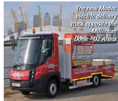
The new Modec electric delivery truck opposite the Millennium Dome - O2 Arena

The new vehicle, built by Modec, is already in service, delivering electric scissors and alloy access towers across the London Docklands area, the City and West End of London.