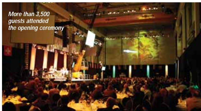
More than 3,500 guests attended the opening ceremony

Chief executive Erich Sennebogen said: "In the future we will be able to react even faster. With optimised processes from goods delivered to the dispatch of machines, allowing for increased planning reliability and shorter turnaround and delivery times."