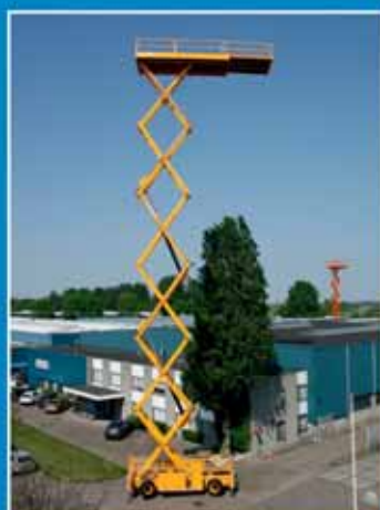
34 metre G-320DL30 4WDS/N

Solutions for difficult terrain, narrow spaces and extreme heights