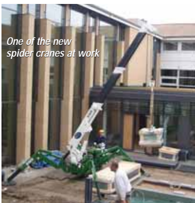
One of the new spider cranes at work

The order, one of the largest spider lift orders ever placed in Europe, includes three URW-706's, two URW-295's and 14 URW376's. Nine machines have already been delivered with the remainder due in February of next year. All will be painted in BMS' green and white livery and named after the daughter or grand daughter of a BMS employee as is the tradition. They will then be distributed among the company's six depots. The cranes add to the company's fleet of 125 mobile cranes and more than 1,000 aerial lifts.