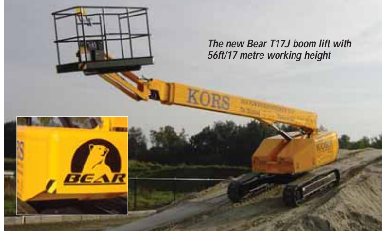
The new Bear T17J boom lift with 56ft/17 metre working height