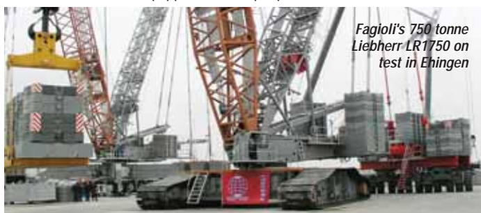
Fagioli's 750 tonne Liebherr LR1750 on test in Ingingen

with a 114 metre main boom, 84 metre luffing jib, derrick boom and suspended counterweight system. Fagioli was founded in 1955 as a transport company and is headquartered in S. Ilario D'Enza near Parma. Over the years it has gradually expanded its services to include heavy lifting and installation and the movement of exceptional loads. It employs around 500 people worldwide.