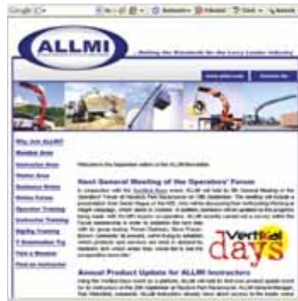
The newsletter feature

training providers, as well as those outside of the association. It will also be used to keep people abreast of the issues affecting the industry and that the newsletter would contain direct links to various pages on the ALLMI website.