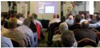
Manufacturers updated delegates on their products.

Using the Vertical Days as its platform, ALLMI held its first ever Product Update Event for accredited instructors at Haydock Park on the 20th September.