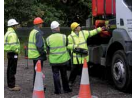
.... and demonstrations of new features