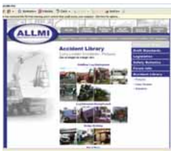
The new accident library section of the ALLMI website