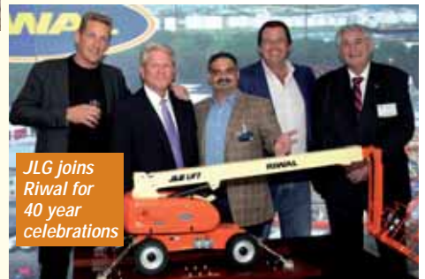
JLG joins Riwal for 40 year celebrations

The US government plans to take control of Fannie Mae and Freddie Mac.