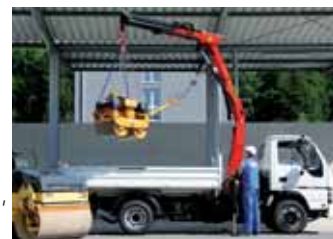
The Palfinger PK4501EH

Palfinger launches new models in it High Performance crane range: The PK 4501, the PK 5001, the PK 6501, the PK 7001 EH, the PK 7001 K as well as the PK 12002 EH.