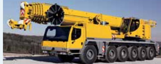
Liebherr unveils its 150 tonne six axle LTM 1150-6.1 with six section, 66 metre main boom and 93 metres maximum hook height.