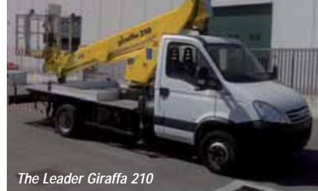
The Leader Giraffa 210

Carlos Sastre of Spain wins the 2008 Tour de France