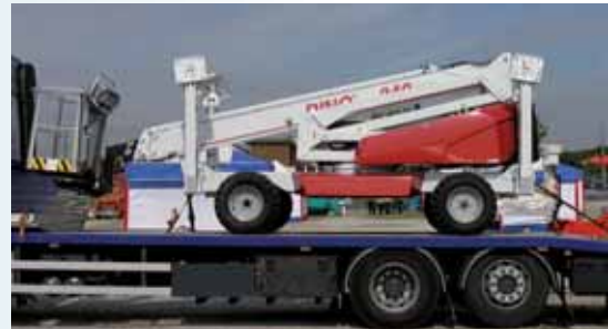
Dino moves its UK distribution to The Spiderlift Company.