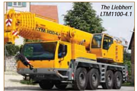
The Liebherr LTM1100-4.1

Sany the crawler crane manufacturer breaks ground on a new €60 million facility in Bedburg/Bergheim, North Rhine Westphalia, Germany.