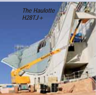
The Haulotte H28TJ+

2008 will be a year we all remember with the world's banks faltering, while the price of oil and food soared only to all come crashing down by year end. While the crane industry continued to do well while most of the aerial lift industry after a strong start to the year declined steeply. It was a very eventful year, hopefully 2009 will be just a little less so.