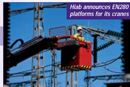
Hiab announces EN280 platforms for its cranes

Pádraig Harrington wins the 2008 PGA Championship