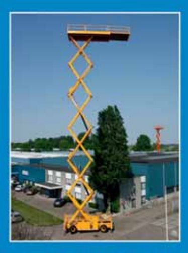
34 metre G-320DL30 4WDS/N