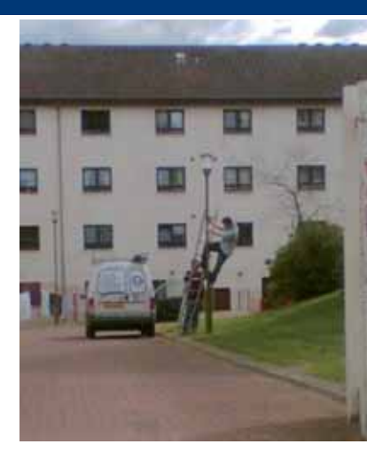
These tradesmen have some ladders but are still struggling to reach the lamp. Clearly some common sense training is required.