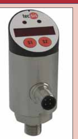
The new Tecsis SC400 pressure switch.

The integrated LED display not only provides a continuous pressure indication but also allows for easy set up together with the programming buttons. All parameters, such as the switching points, the switching mode (NO, NC) and the analogue output, can be set up very easily. An integrated