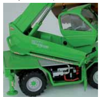
Attention to detail is excellent.

The model also comes fully equipped, not only with the optional crane jib and work platform, but also