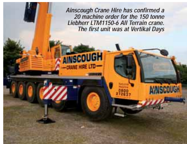
Ainscough Crane Hire has confirmed a 20 machine order for the 150 tonne Liebherr LTM1150-6 All Terrain crane. The first unit was at Vertikal Days