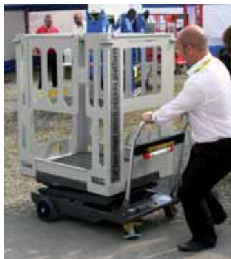
Bravi UK showed off its new Bluelift machines as well as the new two man EddieLift Phat platform.

Bravi UK was also showing its new two man push-around lift, the 1.65 metre platform EddieLift Phat which weighs just 260 kg and yet has a lift capacity of 300kg and an 800mm x 1,000mm platform with dual entry gates.