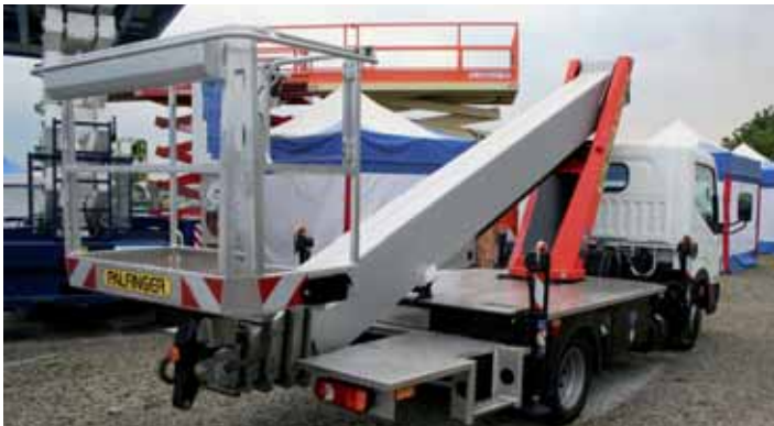
Palfinger claims its 25.8 metre P260B is the highest platform on a 3.5 tonne chassis