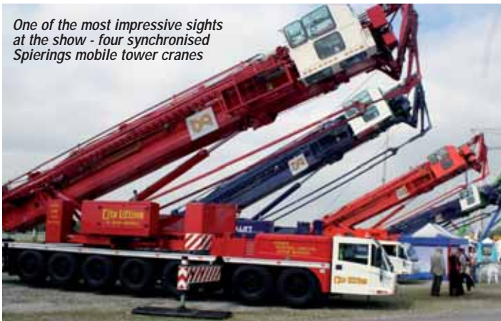
One of the most impressive sights at the show - four synchronised Spierings mobile tower cranes