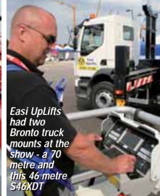
Easi UpLifts had two Bronto truck mounts at the show - a 70 metre and this 46 metre S46XDT