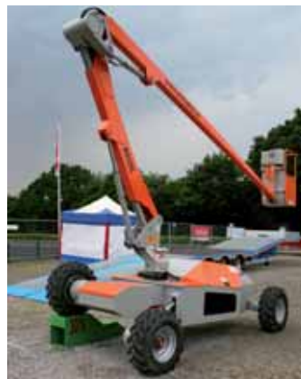
The 12 metre working height Mecaplus ME12SL is specifically aimed at the arborist sector being fitted with a compressor to power air tools in the basket.

In its first outing in the UK, specialist Spanish access manufacturer Mecaplus showed its two, 12 metre working height, self-levelling