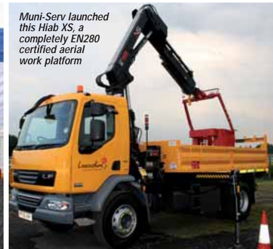
Muni-Serv launched this Hiab XS, a completely EN280 certified aerial work platform