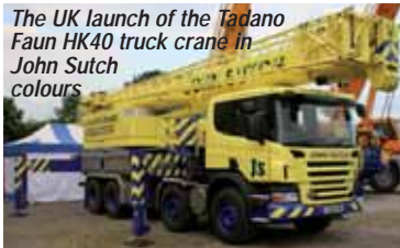
The UK launch of the Tadano Faun HK40 truck crane in John Sutch colours