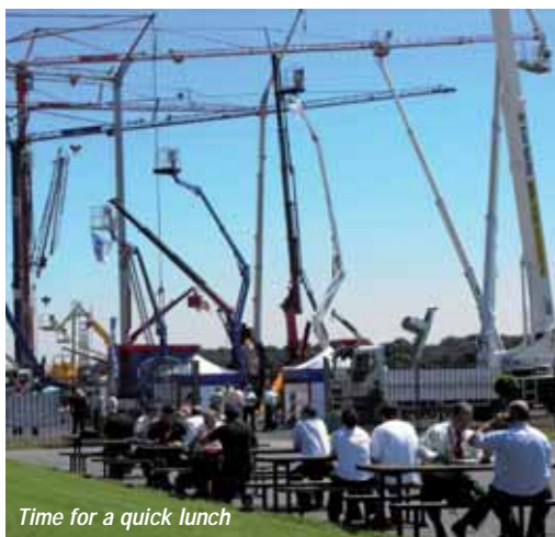
Time for a quick lunch