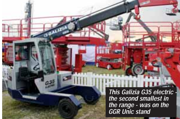
This Galizia G35 electric - the second smallest in the range - was on the GGR Unic stand