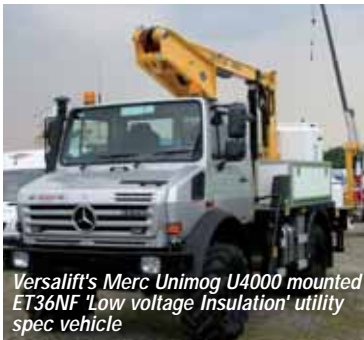
Versalift's Merc Unimog U4000 mounted ET36NF 'Low voltage Insulation' utility spec vehicle