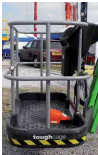
The almost indestructible Toughcage.

Aerial Platforms Jason Seddon also popped into the Niftylift stand just as the show was closing on Thursday and put in the first order for Nifty's brand new HR21 'Hybrid' -21 metre articulated self propelled boom which introduces an environmentally conscious drive system that could easily catch on in the aerial lift industry.