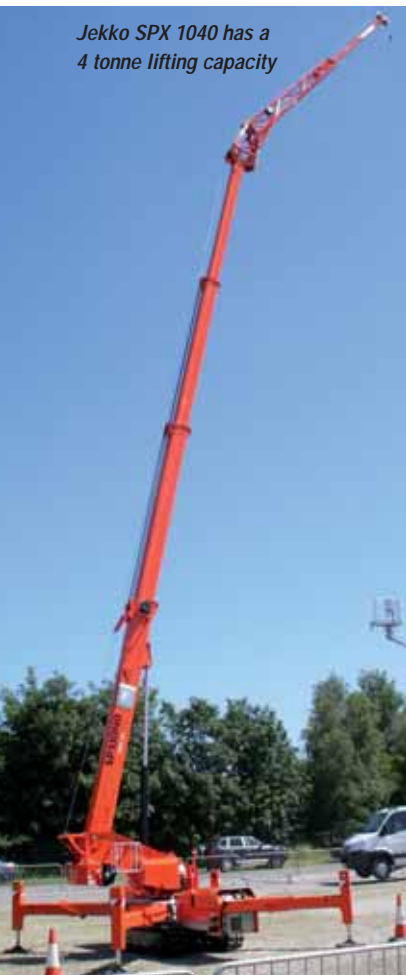
Jekko SPX 1040 has a 4 tonne lifting capacity

Italian tracked mini crane manufacturer Jekko used Vertikal Days to show off its largest machine to date, the new four tonne capacity SPX1040. Described as a 'Unic 706 without the maximum lift capacity' the machine is available in two distinct versions - the 1040.IS with a 14.5 metre four section boom and 4.8 metre swing-away with 2.7 metre stinger extension and the IIA with an 11.2 metre long, three section boom and extendible track width, which improves its maximum pick and carry capacity from a one tonne maximum to 2.4 tonnes. Two track widths - 1.45 and 2.05 metres - are available both giving the same lifting charts, but the wider allowing the load to be slewed. The most significant new feature is the stability control which provides the operator - who inputs the configuration - with a graphic display of the working area through automatic monitoring of the outriggers. Transport dimensions of the 1040.IS are 1.4 metres wide, 5.3 metres long and just under two metres high with the 1040.IIA slightly larger.