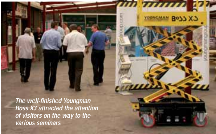
The well-finished Youngman Boss X3 attracted the attention of visitors on the way to the various seminars

equipment including its 'T-jointless' BoSS Evolution tower system, a telescopic platform ladder Teleguard and Transforma - a professional multi-function ladder.