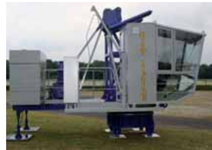
Although just the cab section was at the show, the Artic Crane Raptor 84 is an articulated 'K' type jib tower crane with an out of service radius of just four metres.