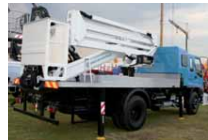
Oil&Steel has joined forces with Cumberland Industries producing this 25 metre platform specifically for the Middle East.

After five world premiers at Intermat, Oil&Steel brought two new products - the Octopussy 1500 Evo tracked spider and Snake 1770 compact truck mounted platform. The company has also joined forces with Cumberland Industries producing a 25 metre platform with insulated basket mounted on a 14 tonne chassis and designed specifically for the market in the Middle East. Sales of this machine have already reached three figures and there is thought to be other models in the future.