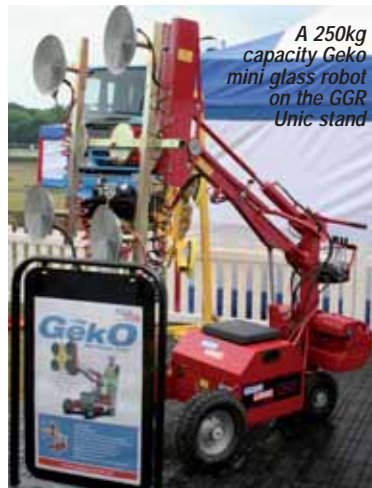
A 250kg capacity Geko mini glass robot on the GGR Unic stand