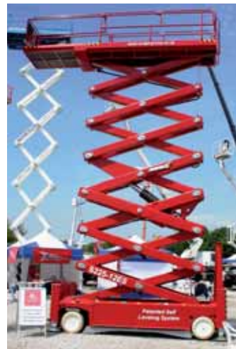
Ranger was showing Aichi and PB Liftechnik products for the first time in the UK.

Two new product ranges - the Japanese Aichi and German PB Liftechnik -were displayed for the