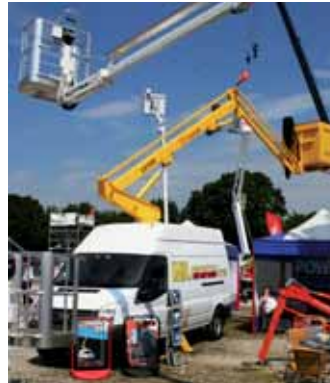
Power Lift UK was showing several new machines including the Easy R160 spider and the 12.5 metre LV125 van mounted platform on a Transit chassis with 330kg payload.

Another company showing new product was Cambridgeshire-based Power Lift UK with its new 12.5 metre LV125 van mounted platform on a 3.5 tonne Transit chassis which has 330kg payload. Also first time in the UK was the tracked spider Easy R160, a more compact lift than the R150 seen at last year's event yet with an extra metre of height. Malcolm Kitt of Power Lift said that the new 21 metre