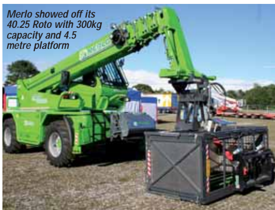
Merlo showed off its 40.25 Roto with 300kg capacity and 4.5 metre platform

Alan Russon is sandwiched between Ben Bowers (l) and Ben James of Lifterz after confirming an order for four more Iteco IT12122 scissors.