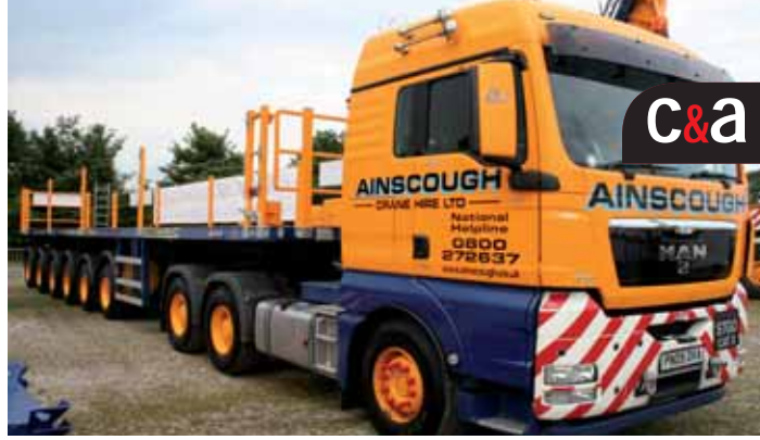
Tinsley had a good show with its first 'Safety Gard' sale early on the first day. In total it has sold 85 systems, 50 of those to Ainscough Crane Hire.

Tinsley also showed its latest single-beam semi-trailer with extendible load floor.