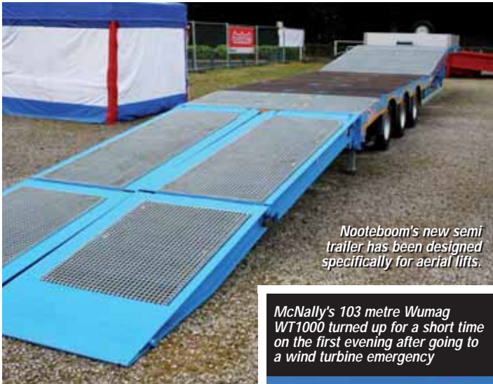
Nooteboom's new semi trailer has been designed specifically for aerial lifts.