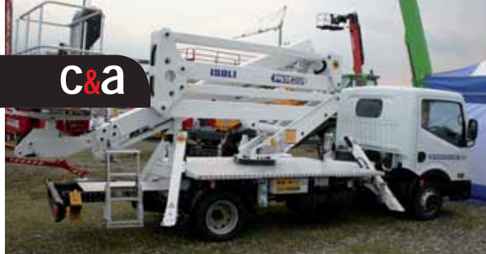
First showing in the UK for Isoli and one of its truck mounted platforms, on the Promax Access stand.

Platform Basket's latest spider platform the 22 metre, 22.10 could be seen for the first time in the UK although the prototype machine (seen originally at InterMat) will undergo a few more modifications such as re-routing cables before the first units are delivered. Confirmed just prior to the show, Promax Access has also taken on the Isoli franchise for the UK and was showing one of its highly regarded truck mounts, the PNT 205, on the stand.