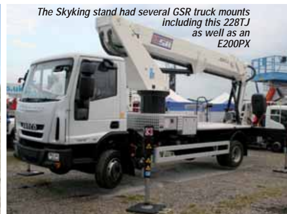
The Skyking stand had several GSR truck mounts including this 228TJ as well as an E200PX