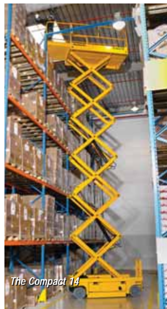
The Compact 14