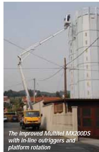
The improved Multitel MX200DS with in-line outriggers and platform rotation

The first new model - the MX200DS - is a new version of the company's highly successful MX200 series. The second unit is a 20 metre straight telescopic boom Multitel MT202DS with 10 metres of outreach from its narrow footprint. The MT202DS slots neatly between Multitel's 18 metre MT182 with its 13 metres of outreach, and the 22.2 metre MT222, all of which are available on Nissan Cabstar, Renault Maxity or Mercedes Sprinter chassis.