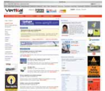
The home page of the new Vertikal.Net

Vertikal.Net was launched in early 2001 in a simple, no frills format that was inexpensive and easy to use both for the publisher and the reader. Over the years the site has grown beyond all expectations achieving more than five million hits a month with more than two million pages viewed as more than 3,000 visitors log on each work day morning from all around the world. Improvements to the site over the years have built the world's largest lifting database on a foundation