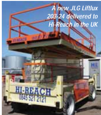
A new JLG Liftlux 203-24 delivered to Hi-Reach in the UK

UK-based Hi-Reach Access has added a number of JLG Liftlux heavy duty diesel scissors with platform heights from 20-26 metres (60 to 86ft) to its fleet. The new units - which include the models