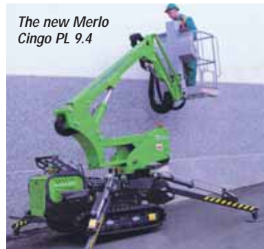
The new Merlo Cingo PL 9.4

although it has made some small local, bolt-on purchases in the past. Such a move is far faster and more likely to succeed and with its strong financial position and record low company valuations the timing would be ideal.