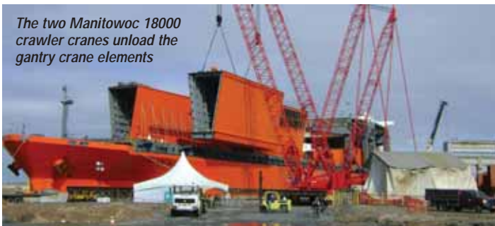
The two Manitowoc 18000 crawler cranes unload the gantry crane elements

Cranes on site include two Manitowoc Model 18000 - one owned by the shipyard and one rented from Dutch based Van Adrighem, a 400 tonne 16000 and a 250 tonne 999. One of the 18000s and the 16000 are equipped with Manitowoc's Max-Er attachment. The remainder of the cranes are largely Grove mobiles provided by local rental company Saraiva.