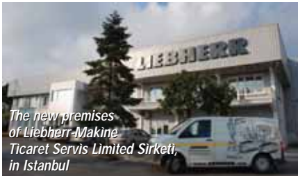
The new premises of Liebherr-Makine Ticaret Servis Limited Sirketi, in Istanbul

The business, which already employs 43, will be responsible for a population of 1,500 items of earthmoving equipment, around 30 crawler cranes and 40 large dockside cargo handling installations.