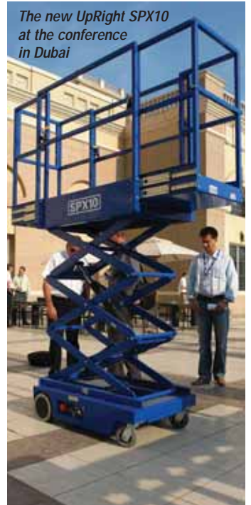
The new UpRight SPX10 at the conference in Dubai

The company also announced that it has upgraded its Speed Level range to offer better gradeability, lower weight and improved lift capacity. The new versions of the SL26SL and SL30SL - will be known as the Speed Level Plus.