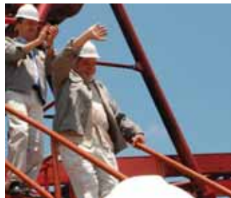
The president of Brazil, 'Lula' after having operated the Manitowoc 18000.

The President of Brazil, Luiz Inácio Lula da Silva (popularly known as Lula), recently took the controls of a 750 tonne Manitowoc Model 18000 crawler crane for a keel-laying ceremony at the Atlântico Sul Shipyard in Ipojuca, Pernambuco State.