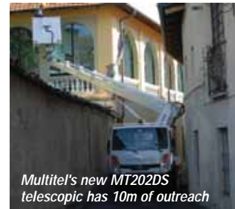
Multitel's new MT202DS telescopic has 10m of outreach