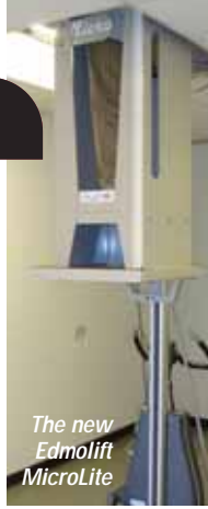
The new Edmolift MicroLite

The new lift joins the range of low level platforms - including the Tzip Micro - which share the same lift mechanism. The overall footprint of the new model is just 980mm x 740mm, so it passes easily through a standard doorway or into a passenger lift.