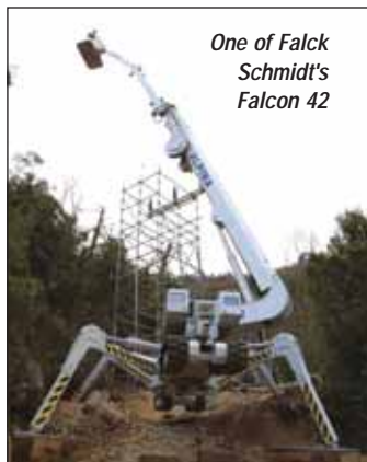
One of Falck Schmidt's Falcon 42

More details on the new model will be unveiled at Bauma with delivery of the first unit expected in August 2010. The largest spider lift currently produced is the Teupen Leo 50. The company is also looking at an even larger spider possibly 60 to 70 metres. The Leo 50 has proved a popular machine for the electrical transmission market. Falck Schmidt follows a slightly different design philosophy and based on its experience in high atrium applications, tailors its models for narrow indoor applications as well as for rough terrain.