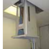
The one man cage will easily pass through a 500mm opening.