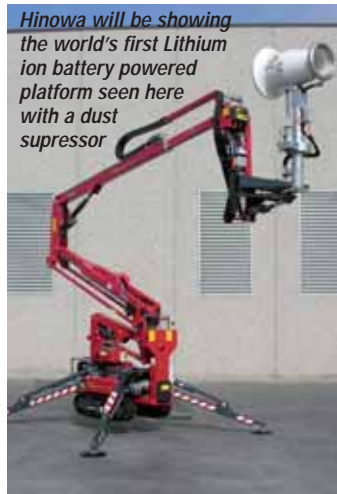
Hinowa will be showing the world's first Lithium ion battery powered platform seen here with a dust suppressor

The company is packaging the new limiter with its XP (eXtra Power) system and latest RCS/RCH remote control systems.