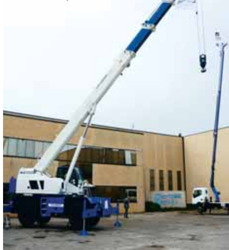
The ARM500 unveiled at PC Produzioni's premises in Boretto

Maximum pick and carry capacity is 12.9 tonnes.