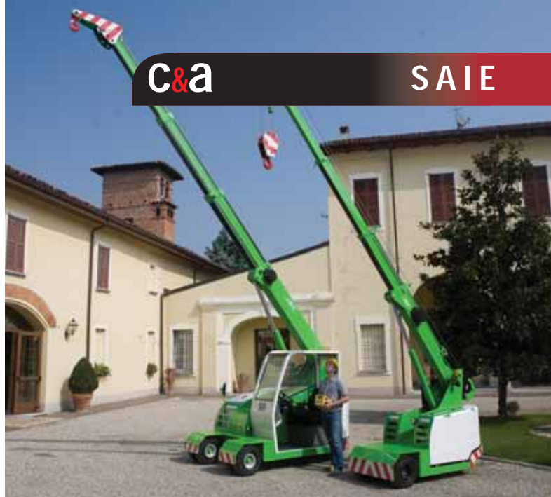
A new entrant into the sector will launch a five machine range of pick and carry machines up to 60 tonnes.

Two Eagle S machines will also be on display - the 5031 and 6232 - as well as a 'special' 15 metre telescopic platform on a Mercedes Unimog made specifically for Italian Energy Company ENEL. The platform has been designed for off road use and on steep slopes when levelled with its outriggers.