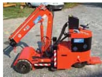
The new Kegiom 200 Panda is a compact, electric ride on pick and carry crane.

Another Italian crane producer, Locatelli is promising something new and will be showing its 50 tonne capacity Rough Terrain Gril 8500TL to its home market for the first time. The compact crane features a five section boom from 9.47 metres to 37.2 metres, tilting cab. The 35 tonne Gril 8400T with 29.5 metre hexagonal section boom will also be on the stand.