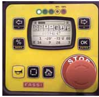
Fassi's FX500 load limiter.