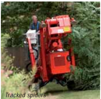
can be driven to the work area