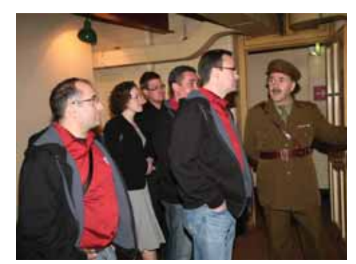
On arrival guests find an occupant left over from the 1940's.