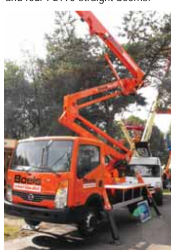
A 20 metre CMC TB200, one of 18 new truck mounts ordered by Boels

Kraan en Truck Service showed one of 18 CMC new truck mounts that it has sold to rental company Boels. The order, which follows six units that it acquired last year, includes four TB200 articulated booms, 10 PL 210/212 straight telescopics and four PL190 straight booms.