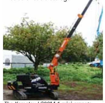
The Komatsu LC08M-1 mini crane's tracks extend from 850 to 1,580mm while the counterweight extends hydraulically.

An unusual exhibit was a 1,590kg Komatsu LC08M-1 mini crane. While no longer in production the 800kg crane sported a range of impressive features for its size, including a 5.1 metre all hydraulic boom and hoist with 43 metres of cable storage.