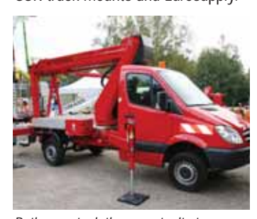
Ruthmann took the opportunity to launch its new TB270 and TBR200 models in Holland.

Other companies reporting sales included AllLift Michielsen which took an unexpected order for three GSR truck mounts and Eurosupply.