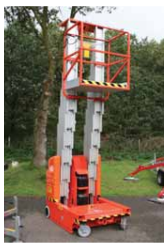
A 14 metre Dingli dual mast self propelled vertical lift on the Faraone Netherlands stand.

Chinese manufacturer Dingli had several aluminium self-propelled machines at the show on different stands and in different liveries.