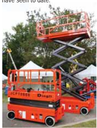
The 20ft Dingli JCPT0808 and JCPT1012 narrow scissor lifts on the Alp Lift stand. Heli demonstrated the Guerenuk 500 telehandler mounted glass manipulator. The battery powered unit is operated by remote control and features a short side shift mounted telescopic boom that luffs through almost 180 degrees, a short articulated linkage ads further

Alp Lift which imports Airo scissors and booms has taken on the Dingli scissor lift distribution for Holland and Belgium. The two units on show - a classic 20ft narrow and 26ft/46inch model - looked impressive in terms of quality and finish and as good as any Chinese-built scissor lift we have seen to date.