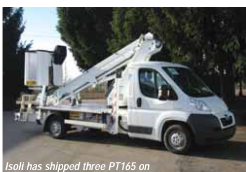
Isoli has shipped three PT165 on Peugeot Boxer chassis to Morocco

Three Isoli 16 metre truck mounted telescopic PT 165 boom lifts with insulated platforms have been shipped to a municipality in Morocco for tree trimming and lighting work. The units are mounted on Peugeot Boxer 3.5 tonne chassis.