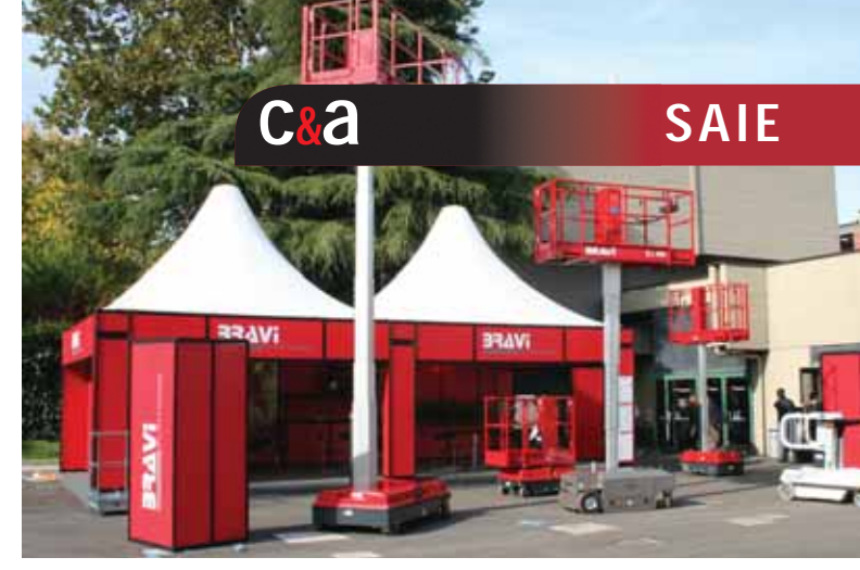
Bravi stayed with the stand position it has occupied for the past 10 years – unfortunately no-one else was in that area. Even so, the company showed its full range including the successful Caddy which is starting to sell in big numbers to 'big box' retail outlets and promised a new 'small, rental machine' in the very near future.