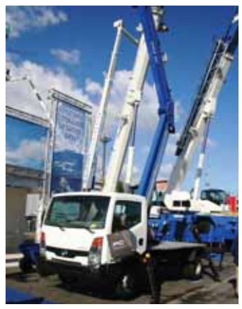
The 20 metre GDX 20 truck mounted platform is the first 'PC' designed platform the company used to manufacture for and has taken over Lionlift platforms. International dealers for cranes and platforms are being sought...