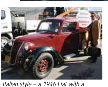
Hiab loader was on the Hiab stand to celebrate its 50th anniversary.