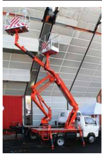
Italian manufacturer Colombo Giuseppe showed several new models including a 10 metre platform on a 1.85 tonne chassis, the 14 metre TLC14-7 and an 18 metre working height, nine metre outreach TLC 418.