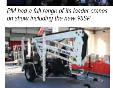
This was launched at Bauma earlier this year but it is the first time we have managed to take a picture of the Platform Basket TR18.90 trailer lift!