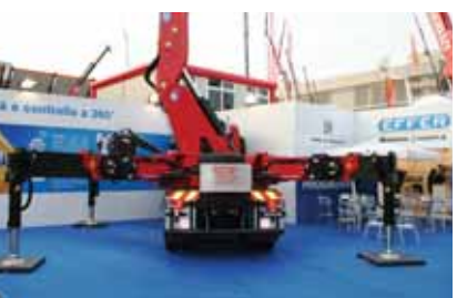
Lorry loader Effer had an impressive stand highlighting the stability systems on its latest models.