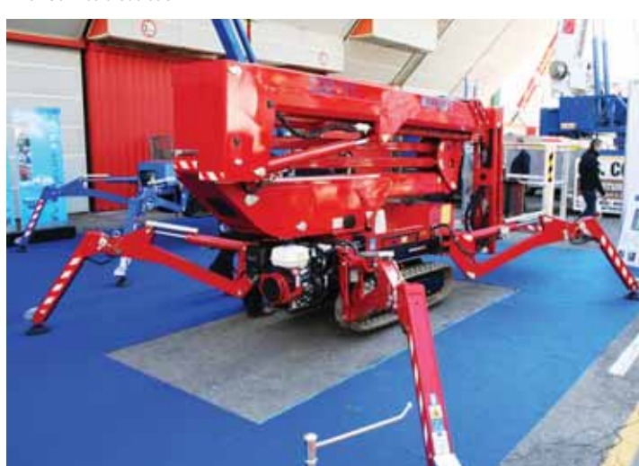
Bluelift goes from strength to strength showing off the improved version of its C22-11 with platform self stabilisation and levelling undercarriage. Watch out for 25 and 30 metre models and lithium ion power in the future.