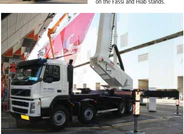
Not quite the tallest platform at the show, Barin showed off its 73 metre AP73-35J2 with 35 metre outreach.

Other highlights included Merlo's 30 metre telehandler to go head to head with the Manitou unit launched in 2006, the new 21 metre low-riding GSR E210PX, Oil&Steel's new flagship Eagle 6035, Platform Basket's 13 metre lightweight telescopic boomed spider lift, CTE's 17 metre lithium ion battery powered spider lift, Fassi's 180 tonne metre F1800AXP loader crane, CMC's 24 metre articulated boom on a 3.5 tonne chassis, Multitel's massive 83 metre 830, Socage's pick-up mounted A314 with superstructure levelling and the 85 tonne Rough Terrain crane from PC. Best small product? The Elibia auto hook seen on the Fassi and Hiab stands.