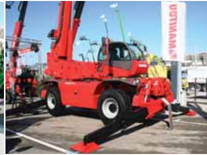
Manitou's MRT3050 now looks bulky and in need of a revamp alongside the Merlo