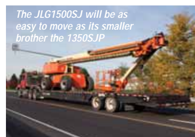
The JLG1500SJ will be as easy to move as its smaller brother the 1350SJP