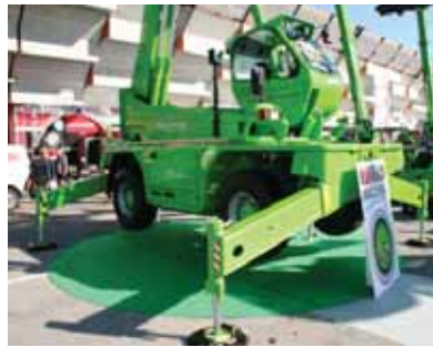
The new Merlo Roto 4030MCSS