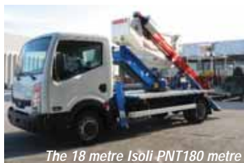
The 18 metre Isoli PNT180 metre

Italian-based truck mounted lift manufacturer Isoli has appointed HDW as its distributor for the Netherlands. Ridderkerk-based HDW which also distributes Genie, Teupen and Unic mini cranes, will focus its efforts on Isoli's range of 3.5 tonne Nissan Cabstar mounted lifts, including 15 to 22.5 metre telescopic models and 14.2 to 20.6 metre articulated units. HDW - part of the Pon group - will also offer Isoli's two year warranty and full maintenance programme in Holland.