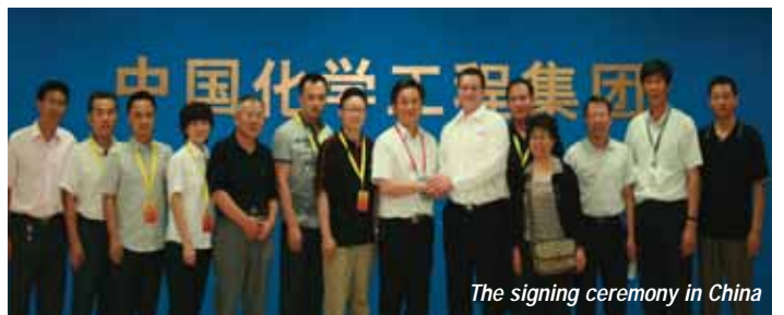
The signing ceremony in China

Terex Cranes has signed a contract with China National Chemical Engineering Co. for the delivery of 41 cranes. The deal, the largest order received by Terex Cranes in China to date, includes seven 350 tonne AC350/6 All Terrain cranes and 34 Terex Changjiang truck cranes with capacities ranging from 25 to 130 tonnes.