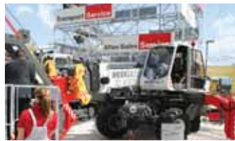
Swiss manufacturer Jakob has also introduced a 30 metre telehandler

Merlo has announced that all of its Roto telehandlers are now equipped to meet the new EN13000 crane standards as standard, complete with the external key operated override switch for the load moment indicator.