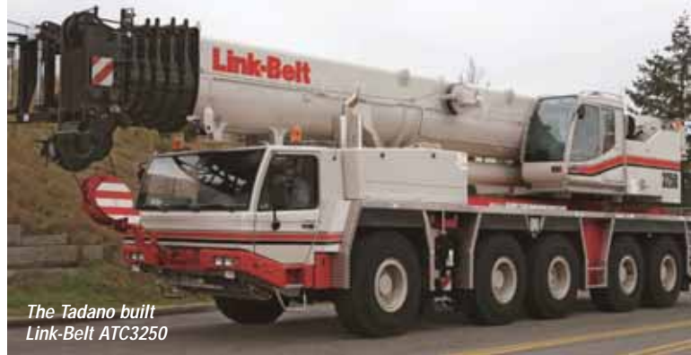
The Tadano built Link-Belt ATC3250

Tadano and Link-Belt have issued a joint statement ending their supply agreement for All Terrain cranes. The agreement provided Link-Belt with Tadano-Faun manufactured All Terrain cranes to sell under the Link-Belt brand on a non-exclusive basis in the North American, Central American and Caribbean markets and largely focussed on the 160 tonne Tadano ATF160 G-5 and 220 tonne ATF220 G-5 marketed as the Link-Belt ATC3200 and ATC3250 respectively.