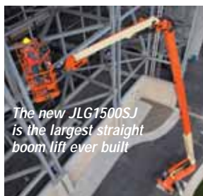
The new JLG1500SJ is the largest straight boom lift ever built