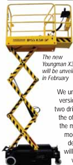
The new Youngman X3XSP will be unveiled in February

TVH said: "Lavendon is an attractive business and well positioned within the access equipment rental industry. However we believe that Lavendon's ability to exploit new growth opportunities and invest in the economic recovery is somewhat limited by its capital constraints and, by combining the two businesses, TVH would be able to accelerate the investment needed into Lavendon's rental fleet, allowing it to take full advantage of the economic recovery and maintain and grow its competitive position within its markets." More details on www.vertikal.net