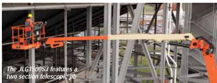
The JLG1500SJ features a two section telescopic jib