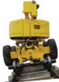
The new Ecostar 11812 is an ultra compact 40ft scissor lift.

The units - built to British RIS1530 PLT Railway standards for overhead electrification work - have been approved by the British Vehicle Acceptance Body (VAB), can travel on rails at speeds of up to 8kph and can tow light rail trailers. They can also handle and work on banked turns, thanks to an automatic superstructure levelling system that copes with up to 200mm/eight degrees of side slope.