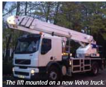
The lift mounted on a new Volvo truck.