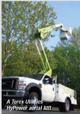
A Terex Utilities HyPower aerial lift