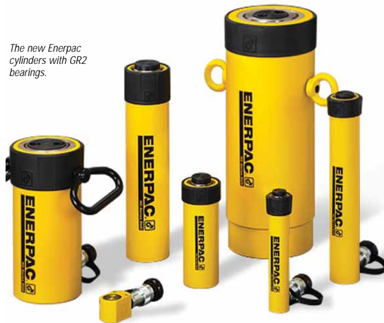
The new Enerpac cylinders with GR2 bearings.

At the same time new heavy-duty return springs help retract the cylinders faster for shorter cycle times. The new cylinders are available with capacities of five to 95 tonne capacities.