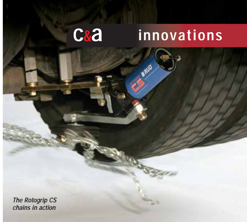
The Rotogrip CS chains in action

drive wheels. A rubber wheel takes power from the tyre so that the chains rotate at a proportionate speed to the wheel. In essence the chains are thrown in front of the moving tyre improving traction by at least 45 percent. The Rotogrip CS kit comes in a box and is retrofitted quickly to standard commercial based vehicles, such as truck mounted aerial lifts, truck cranes and delivery vehicles. All Terrain cranes might be more of a challenge.