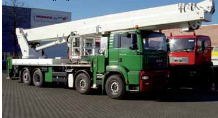
On show for the first time the 70 metre working height WT700

UpRight has announced that it is getting back into booms and that it will shortly relaunch a refined version of its AB46 articulated boom range.