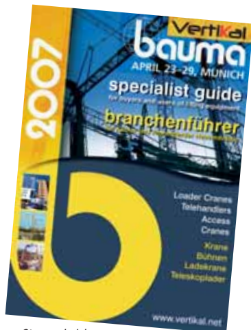
Stop and pick up your copy of Vertical Bauma.

A manufacturer might have a room too many and be willing to turn one over to you and the Munich tourist board has always proved helpful. And of course do not overlook the Bauma website and its official travel agent. Make the effort, you