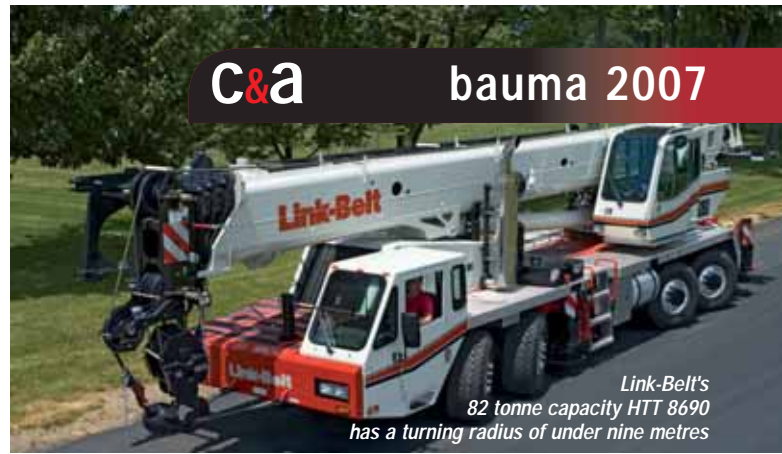
Link-Belt's 82 tonne capacity HTT 8690 has a turning radius of under nine metres