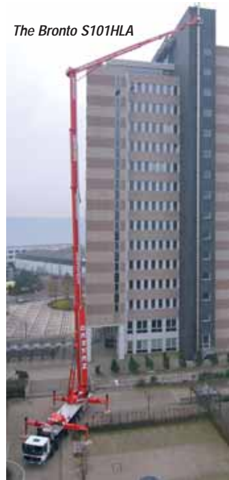
The Bronto S101HLA

The Bronto S101 HLA currently the world's tallest platform has to