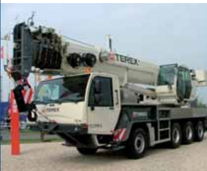
The TC60L launched last year will be joined by a 40 tonne, 3-axle version.

Terex Cranes will be out in force with 13 cranes on display including the first showing of the new 100 tonne four axle AC100/4. The company will also be displaying truck cranes, including the three axle 40 tonne smaller brother of the PPM TC60L shown at Intermat last year. It is also expected to show a 60 tonne, four axle truck crane from its Changjiang operation, 50 percent of which it acquired last year.