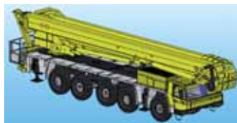
First graphics of what is claimed to be the largest platform in the world.

Wumag will display its new 70 metre WT700 for the first time. This compact, heavy duty platform has a 700 kg platform capacity and up to 35 metres of outreach, a class best according to Wumag. The new model offers variable outrigger widths with automatic load adjustment. Other exhibits will include a 37 metre WT 370 and a 53 metre WT 530. Wumag is keeping details of its 100 metre All-Terrain truck mounted WT 1000 close to its chest but will reveal details at the show. If all goes according to plan the new model will take the world's tallest title away from the Bronto 101