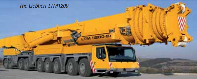
The Liebherr LTM1200

The Liebherr stand is the biggest of the whole show. Centre of attraction will be 'the most powerful telescopic crane in the world' - the nine axle, 100 metre boom Liebherr LTM 11200-9.1 . If anything can dwarf it - it is the 1,350 tonne capacity LR11350 crawler crane which can be rigged to 223 metres.