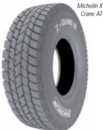
Michelin X-Crane AT

In addition, its radial casing and enhanced tread blocks ensure progressive grip that reduces vibrations and stress on the drive train improving driver comfort.