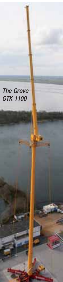
The Grove GTK 1100