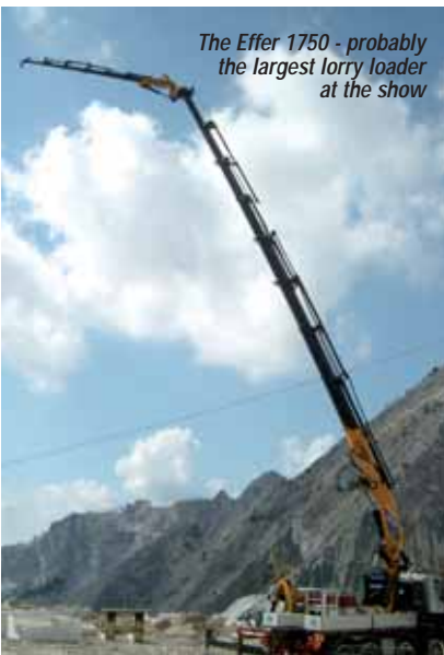
The Effer 1750 - probably the largest lorry loader at the show

Leguan will show off its first scissor lift, an eight metre rough terrain skid steer product which, like its boom lifts, is self propelled in the transport position but must set its outriggers before lifting can commence. The benefit is a low weight of only 1,500kg.