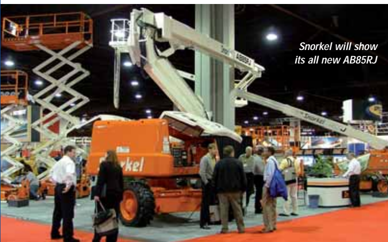
Snorkel will show its all new AB85RJ

Its dual sigma style riser offers zero tailswing and parallel lift and descent. Four wheel drive and steer on a fixed 2.4 metre wide chassis completes the package.