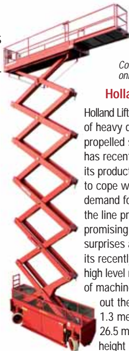
The massive Combistar 265EL13 is only 1.3 metres wide.

Meanwhile it will also show an improved version of its 16 tonne/metre 165.11.3S with a new top boom offering up to 195 degrees of articulation. The 165 has been specifically designed for the building industry and general cargo.