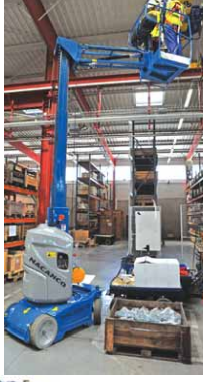
The Genie GR26J.

Check out the changes to the Mantis 15010.