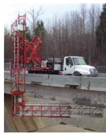
The Terex Hydra HPT 11/38.

Terex will show its new Hydra HPT 11/38 truck-mounted under-bridge inspection platform, the smallest model in its truck mounted under-bridge range.