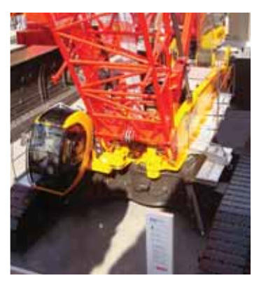
Sany's 300 tonne SCC8300 will make its international debut in Las Vegas

SCC8300 self-assembling latticeboom crawler crane unveiled at Bauma China in October. The company says that this is its first crawler crane designed specifically to satisfy western market expectations with particular focus on North American buyers.