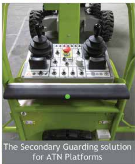
The Secondary Guarding solution for ATN Platforms