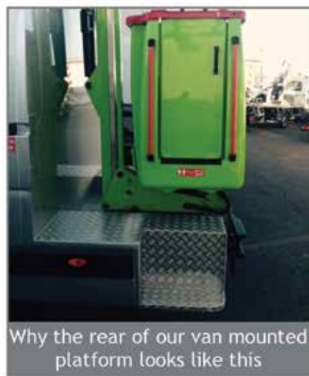
Why the rear of our van mounted platform looks like this

Designed to be different // Built for you