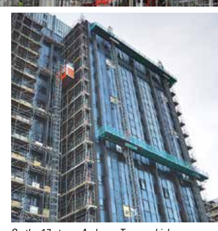
On the 17 storey Archway Tower which sits directly above the live Archway Underground Station Brogan is providing five, double-stacked mastclimbers mounted on heavy duty scaffold gantries.

Over the last 12 months, Brogan has seen a substantial increase in demand for mastclimbers and hoists and is continuing to invest a substantial proportion of its capital expenditure in fleet expansion. The company is also looking to recruit additional staff such as contracts manager, fitters and installers as part of this expansion, while maintaining its zero Accident Frequency Rate achieved throughout 2015 in both the UK, Ireland and the UAE. To date it has clocked up more than 1.2 million man-hours without a reportable accident.