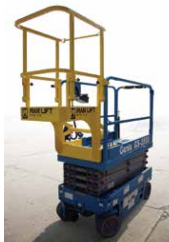
US-based Manlift Manufacturing offers the SHU-30 attachment that can be swapped with a standard roll-out deck extension on a 19ft Genie GS1930, to offer a 750mm step up (Single Hop Up-30inch) for use to gain access through false ceiling panels etc.