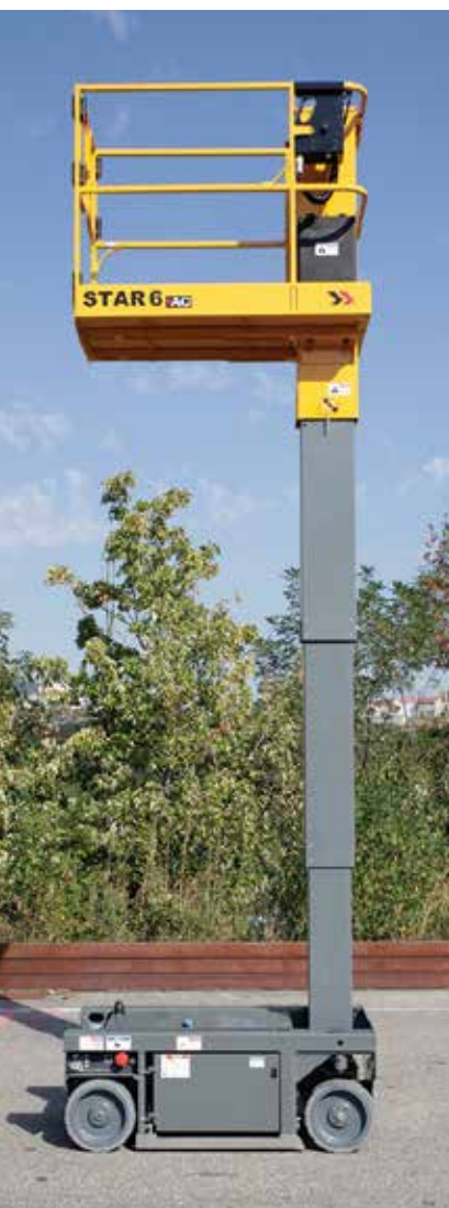
Platforms such as the new Haulotte Star 6 offer strong competition to the micro scissors.

While these new Dingli models look attractive, this sector of the market is increasingly dominated by steel mast-type products from the likes of Snorkel, JLG, Haulotte and Skyjack. The main scissor lift competition is Custom Equipment's Hybrid range so whether it can win business away from these remains to be seen. One misconception is that the micro scissors - such as those offered by Custom and Dingli - are longer and heavier than the mast lifts. The fact is there is very little difference but with the scissors, the platform covers the entire chassis, providing more space, while the mast-type lift loses valuable platform space to the outer mast section.