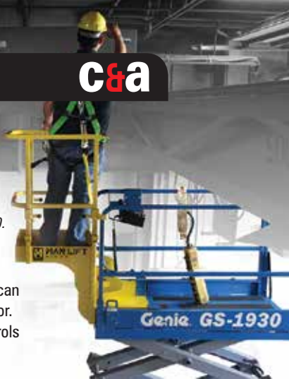
The Manlift SHU-30.

If it is inadvertently triggered it can be reset at height by the operator. The machine's emergency controls can still be used to lower the platform should it be necessary.