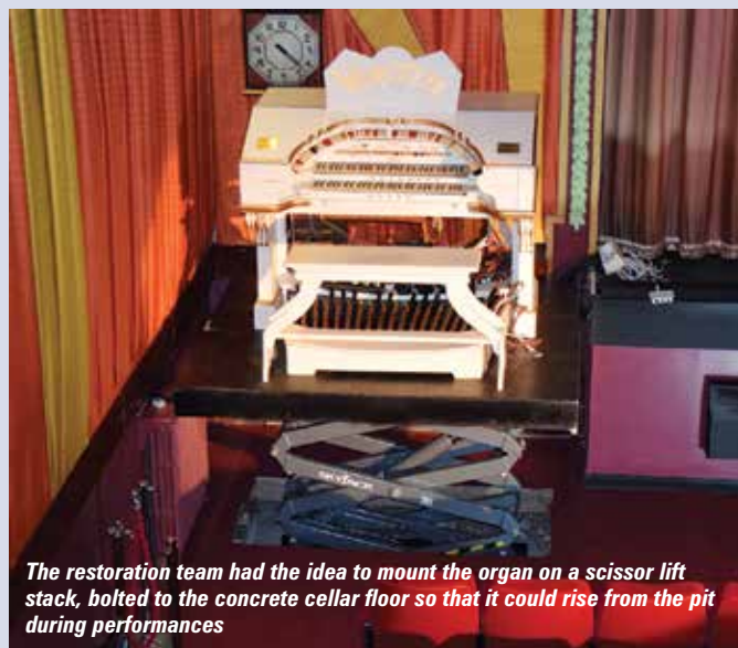
The restoration team had the idea to mount the organ on a scissor lift stack, bolted to the concrete cellar floor so that it could rise from the pit during performances