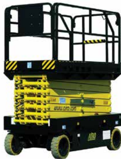
Airo's 14m X14EW has a 1,500mm deck extension but weighs 3,365kg.

The company says the system has been developed with input from contractors, operators and third party certifiers and subjected to extensive live trials. It features a self-test on machine start up and a spring loaded wrist rest that will stop the machine if activated through pressure applied by the operator. It then sounds a siren and activates a blue emergency beacon.