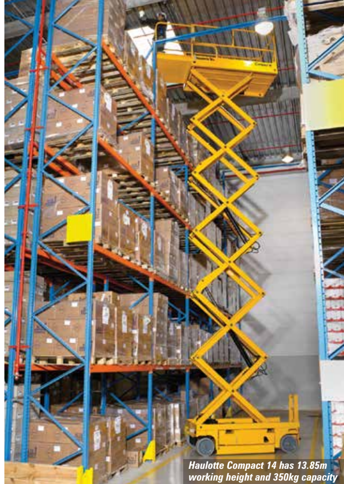
Haulotte Compact 14 has 13.85m working height and 350kg capacity

One manufacturer not mentioned yet is Italian company Airo which offers