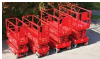
PB's compact 14 metre model (L) has an excellent specification and is the narrowest at 1.15 metres, and one of the lightest at 2,910kg.

Last but not least is Dingli which has both hydraulic and direct electric drive versions of the compact JCPT1412 - the only difference being the electric drive motor version is slightly narrower but heavier, however both models win the weight war, thanks to a highly innovative lightweight design of the upper scissor stack which reduces the machine's centre of gravity.