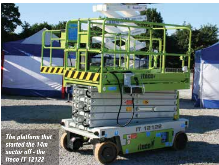
The platform that started the 14m sector off - the Iteco IT 12122