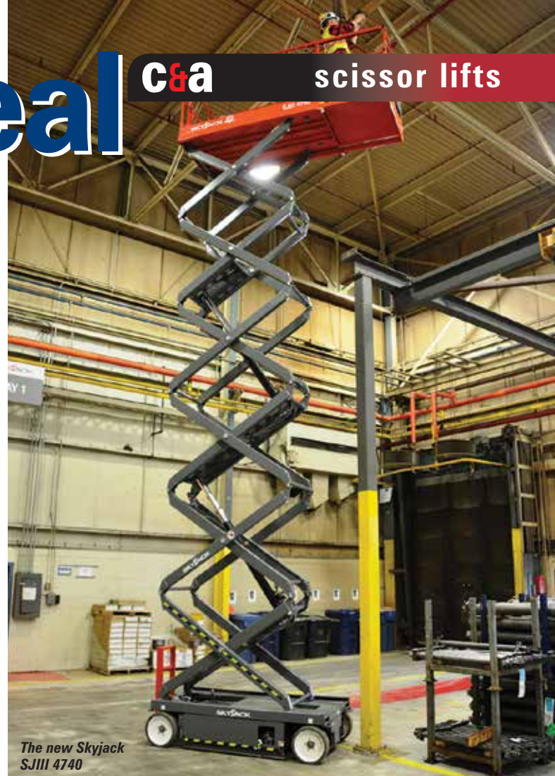
The new Skyjack SJIII 4740

The sector then expanded to a 32ft model on the wider 46 inch/1.2 metre wide chassis with an 11.5 metres working height and remained for many years. The next major breakthrough came in 2006 from Italian manufacturer Iteco which upped the ante exhibiting a