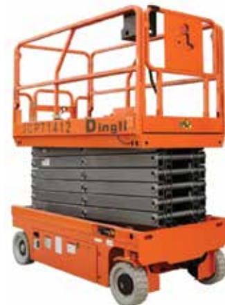
Dingli has both hydraulic and direct electric drive versions of the compact 14m JCPT1412.