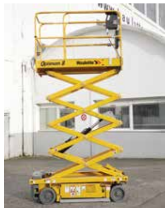
Haulotte Optimum 8.

Haulotte has also upgraded its 20ft, Optimum 8 scissor lift, which now has maintenance-free AC wheel drive motors as well as several other new features such as easier swing-out trays for improved maintenance and Haulotte's ACTIV screen which provides key operational information and diagnostics. Fitted with automatic pothole protection the platform is certified to work outside in winds up to 45kph. Haulotte is planning two new prototypes for Bauma, might one be a compact hybrid/electric Rough Terrain scissor lift?