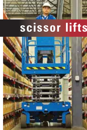
The compact 14m machines have a width of about 1.2m.

however very much a smooth floor machine, but still features automatic pothole protection and 25 percent gradeability. Most buyers will opt for the more traditional DCS model. Both models offer a working height of 5.9 metres and a platform capacity of 240kg. The 1.3 metre long platform extends to 1.89 metres with the deck extension. Overall stowed length is 1.44 metres with the entrance ladder installed, and 1.29 metres with it removed. The DCS weighs 880kg and the Industrial version 860kg, both models have a CE indoor and outdoor ratings, with the DCS limited to 5.6 metres outdoors and Industrial to 4.5 metres.