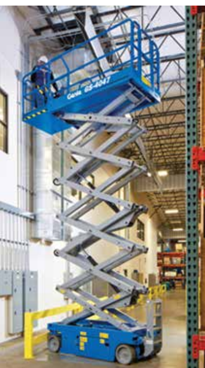
Genie was the first North American manufacturer to enter the 14m compact market, when it launched the GS4047 at the end of 2011.

the X14EW which it claims to be fractionally higher than the others, but again is within the margin for error. It does offer the longest deck extension at 1.5 metres, compared to the more typical 900mm but is also the heaviest at nearly 3.4 tonnes.