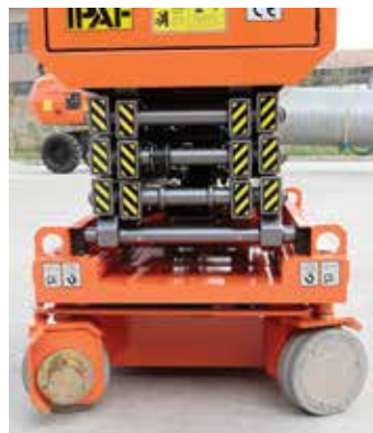
Dingli launched upgraded versions of its 13ft self-propelled micro scissor lifts - the JCPT0607DCI and JCPT0607DCS.

The two models are almost identical, apart from the fact that the DCI 'industrial' version features smaller rear drive wheels, with casters on the front steer axle for zero degree turning. It is