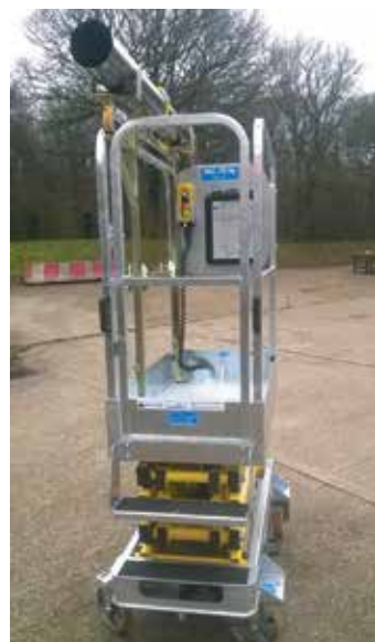
The DRXmicro can support loads up to 40kg.

The company already has two other material handling devices in the deckRailXtra range - the DRXmulti and DRXplus - both can be fitted to other compact lifts.