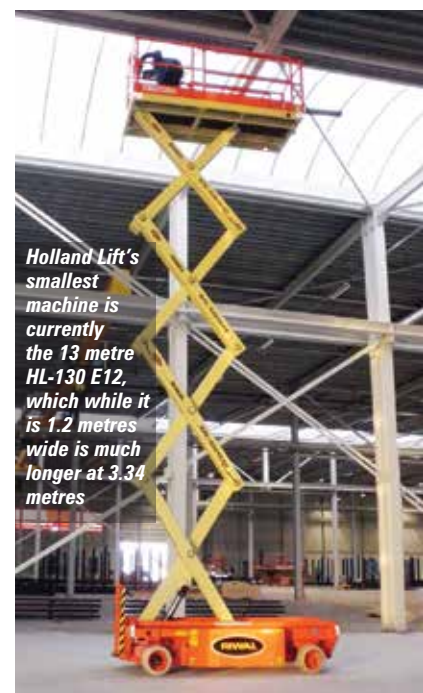
Holland Lift's smallest machine is currently the 13 metre HL-130 E12, which while it is 1.2 metres wide is much longer at 3.34 metres

On the upper end of the height range Holland Lift has a 16 metre working height version of the same machine, the HL-160 E12 although it is even longer at 3.74 metres but has a 750kg platform capacity