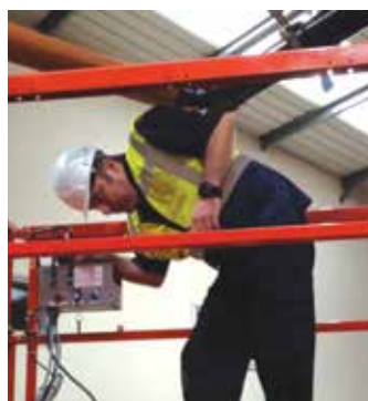
The idea is that if an operator is pushed down on the controller his forearm will activate the system.

As well as new models there have been several other products aimed at improving the safety and productivity of small scissor lifts. Late last year UK-based powered access company Kimberly Rentals launched a secondary guarding system for scissor lifts. Dubbed SkySecure it can be installed on all