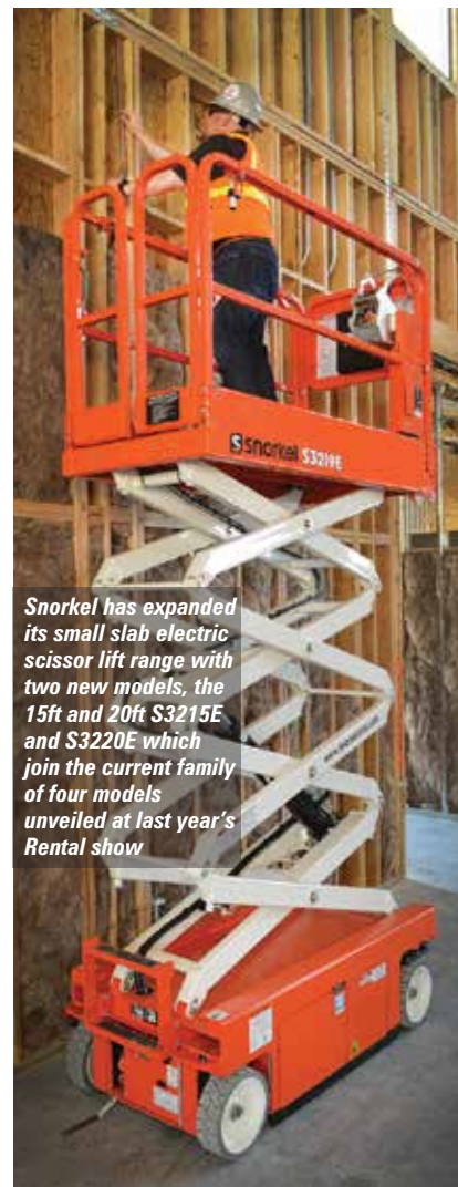
Snorkel has expanded its small slab electric scissor lift range with two new models, the 15ft and 20ft S3215E and S3220E which join the current family of four models unveiled at last year's Rental show