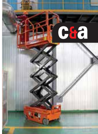
Both Dingli 13ft models offer a working height of 5.9 metres and a platform capacity of 240kg.

however very much a smooth floor machine, but still features automatic pothole protection and 25 percent gradeability. Most buyers will opt for the more traditional DCS model. Both models offer a working height of 5.9 metres and a platform capacity of 240kg. The 1.3 metre long platform extends to 1.89 metres with the deck extension. Overall stowed length is 1.44 metres with the entrance ladder installed, and 1.29 metres with it removed. The DCS weighs 880kg and the Industrial version 860kg, both models have a CE indoor and outdoor ratings, with the DCS limited to 5.6 metres outdoors and Industrial to 4.5 metres.