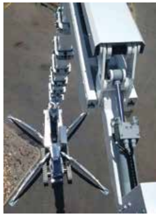
The 3710RBDJ is based on the 3700, but has a new stronger boom.

The company has also unveiled a completely new boom system for its 37 metre spider lift creating the new 3710 RBDJ which replaces the 3700RBDJ launched in 2010. The new seven section boom has a six-sided formed profile to help improve strength and rigidity and is topped by an articulated jib with 130 degrees of articulation and an improved 250kg platform capacity. Maximum outreach is 14.2 metres and the end-mounted basket, boom elevation and telescope can be operated simultaneously without interference to help speed the time taken to reach full height.