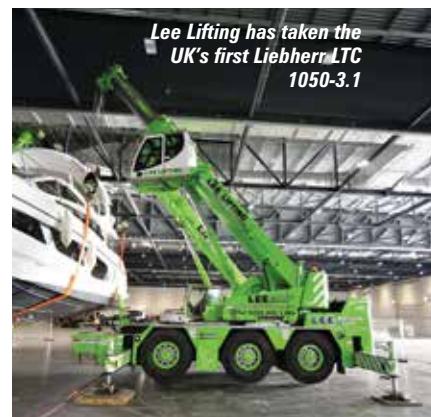
Lee Lifting has taken the UK's first Liebherr LTC 1050-3.1

UK rental company Lee Lifting Services has added a Liebherr LTC 1050-3.1 to its fleet - the first in the UK. The 50 tonner supersedes the 45 tonne LTC 1045 and is powered by the latest six cylinder, Tier 4 final/EU Stage IV Mercedes engine. It features a 36 metre, five section boom plus a 13 metre bi-fold swingaway with 1.5 metre integrated assembly jib which Lee Lifting has taken with set sheaves and cross hook and manual offset of 20, 40 and 60 degrees. One of its first jobs for the new crane was to help set up the London Boat Show alongside other cranes from the company.