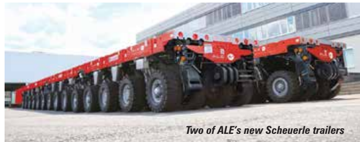
Two of ALE's new Scheuerle trailers

Heavy transport and lifting company ALE has taken delivery of 240 Scheuerle Self Propelled Modular Transporter (SPMTs) axles. The 60 tonne axle lines - fitted with 15 inch tyres - are the highest capacity SPMTs on the market according to ALE. The trailers are powered by environmentally friendly EU 4/ EPA Tier 4 final exhaust emission engines.