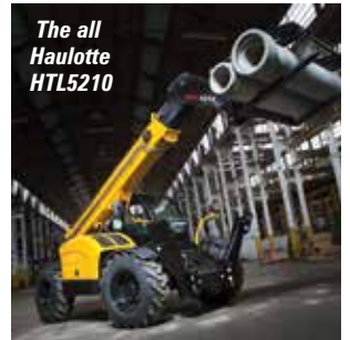
The all Haulotte HTL5210

The Haulotte HTL5210 includes standard stabilisers, hydrostatic transmission and a Tier 4i/ Stage IIIB-compliant Perkins for Europe, or Tier 3-compliant Perkins 95 for the rest of the world. The same power units are used in the Dieci-built telehandlers.