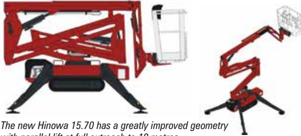
The new Hinowa 15.70 has a greatly improved geometry with parallel lift at full outreach to 10 metres.

The working envelope is significantly better than the Goldlift with a maximum outreach of 6.6 metres which it can raise the basket perfectly parallel to a wall to a height of 10 metres. Unrestricted platform capacity is 230kg including standard platform rotation. Power comes from either a Hatz diesel or Honda petrol engine, with a lithium-ion battery pack option. The first units are expected to ship in July.