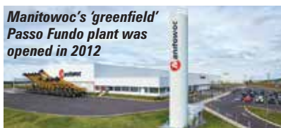
Manitowoc's 'greenfield' Passo Fundo plant was opened in 2012

Manitowoc has suspended crane production at its Passo Fundo plant in Brazil, letting around 80 employees go, while retaining around 20 staff including those covering the parts and service operation which is also based at the facility. The closure was immediate with the company stating that it had substantial new product inventory in place to cover immediate local market sales for 2016 and beyond. It also said that while the indefinite closure was a necessary step in response to falling demand, it intends to reopen the facility at some time in the future when demand dictates.