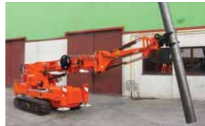
The Jekko pipe and pole handler.

Italian mini/spider crane and aerial lift manufacturer, Jekko has launched a new pipe manipulator attachment for its SPX 1040 spider crane - the GR300. The new attachment has a capacity of 300kg and can grasp, rotate, tilt and manoeuvre pipes into position and hold them while they are fixed in place. It can handle pipes and poles with diameters of between 100 and 330mm, and be used on either the four tonne SPX1040 or the larger 7.5 tonne SPX1275 mini crawler cranes.