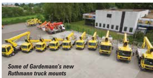
Some of Gardemann's new Ruthmann truck mounts

Lavendon has ordered 42 new Ruthmann truck mounted lifts. The €7.3 million deal makes the UK-based rental group the manufacturer's largest single customer. In the UK Nationwide Platforms will take five 33 metre T 330 models on 7.5 tonne chassis, plus two 28 metre T285 HV 10 models on 10 tonne trucks. The heavier truck allows a significantly narrower outrigger jacking base, compared to the usual 7.5 tonne chassis. In Germany Gardemann will take 35 new units - 29 of which have working heights from 17 to 33 metres on 3.5 and 7.5 tonne trucks, including Ruthmann's new 17 metre T 170 models on 7.5 tonne chassis for municipal applications. The order includes six larger machines topped by the 63 metre T 630.