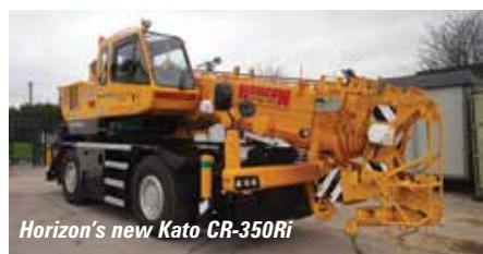
Horizon's new Kato CR-350Ri

Genie has unveiled an updated version of its 3.6 tonne/13.36 metre North American GTH-844 telehandler, with a new high-torque Deutz turbocharged Tier 4 Final engine option without the need for regeneration or diesel exhaust fluid (DEF). It has also taken the opportunity to update the drive-train with new Dana axles while retaining the 8.59 metres forward reach, proportional dual cylinder 10 degrees side to side frame-levelling and multi-functional, proportional joystick controller.