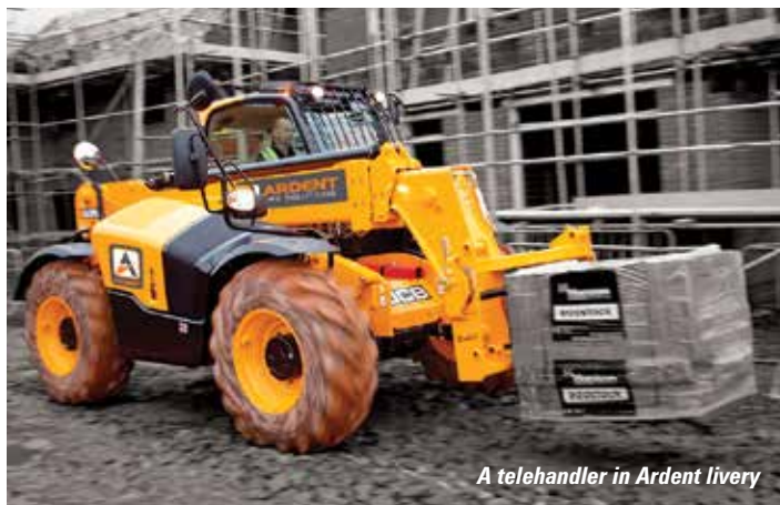
A telehandler in Ardent livery