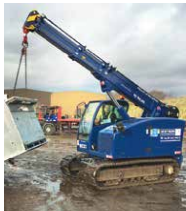
The new Manitex Valla 90TRX.

The new crane fits between the five tonne Valla 55TRX and 12 tonne 120DTRX. It has an eight metre, four section main boom, plus a three metre fly jib option with 15 degrees of offset. The crane has an overall length of just 3.4 metres, is 1.735 metres wide, with an overall height of 2.35 metres. It is available with diesel, LPG or Electric power.