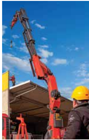
Palfinger's new Fall Protection System will initially only be available in German speaking areas.

The individual wears a fall arrest harness which is attached to a line running from the FPM fall arrester mounted on the crane. Developed following consultations with safety experts in Austria, Germany, Switzerland and the South Tyrol, Italy, the system is currently only offered in those countries.