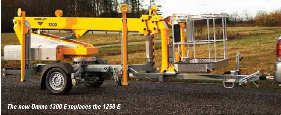
The new Omme 1300 E replaces the 1250 E