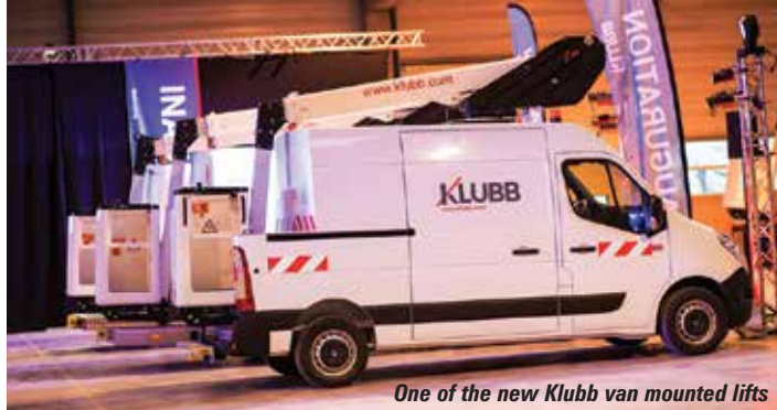
One of the new Klubb van mounted lifts