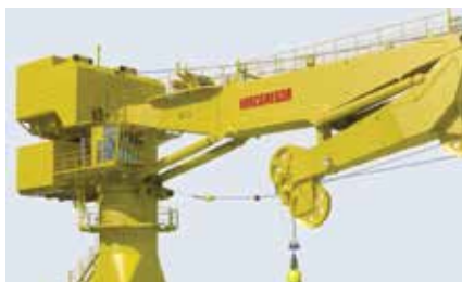
MacGregor's new fibre-rope crane.

MacGregor has introduced a 150 tonne fully heave-compensated knuckle boom fibre-rope crane for the offshore industry. Developed in partnership with Parkburn Precision Handling Systems it can reach 4,000 metres of water depth. A cooperation agreement between the two companies combines MacGregor's offshore crane expertise with Parkburn's fibre-rope tensioning technology.