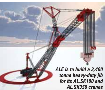
ALE is to build a 3,400 tonne heavy-duty jib for its AL.SK190 and AL.SK350 cranes

UK-based heavy lift and transport company ALE plans to build a 3,400 tonne capacity, heavy-duty jib that can fit onto both of its ultra-heavy lift AL.SK190 and AL.SK350 cranes. The new modular design jib will have lengths up to 100 metres, and be built from S1100QL specialist high yield steel. The jib is expected to be completed by the end of the year, its first contract will involve lifting 2,800 tonne modules to a height of 65 metres.