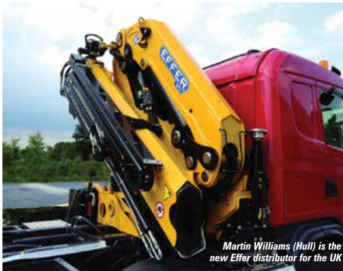
Martin Williams (Hull) is the new Effer distributor for the UK