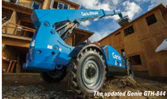
The updated Genie GTH-844

Genie has unveiled an updated version of its 3.6 tonne/13.36 metre North American GTH-844 telehandler, with a new high-torque Deutz turbocharged Tier 4 Final engine option without the need for regeneration or diesel exhaust fluid (DEF). It has also taken the opportunity to update the drive-train with new Dana axles while retaining the 8.59 metres forward reach, proportional dual cylinder 10 degrees side to side frame-levelling and multi-functional, proportional joystick controller.