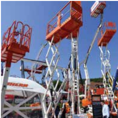
The new Snorkel scissors.

Snorkel has announced two new small electric scissor lifts, the 15 and 20ft S3215E and S3220E. The new models - shown in prototype form at Platformers Days in September - join the current family of four lifts unveiled at last February - the S3219E, S3226E, S4726E and S4732E, with 19, 26 and 32ft platform heights respectively. The S3215E offers a 6.5 metre working height with a platform capacity of 272kg, while the S3220E has 8.1 metres and 408kg capacity. (See Electric scissors page 17 for more details)