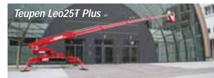
Teupen Leo25T Plus

Ranger Equipment: Stand 134A Ranger represents Aichi, Teupen and PB Lifetechnik. The highlight of its stand will be the new 25 metre Teupen Leo25T Plus spider lift with its 18 metres of outreach, compact dimensions and adjustable tracks. The other new product on show is the Teupen Leo18GT Facelift.