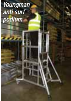
Youngman anti surf podium

This rapidly growing company specialises in a wide range of non powered access equipment including a range of different ladders, low level and mobile access towers, including its Hylite range. The company also offers bespoke solutions and training. PASMA members Youngman and Pop-Up products are exhibiting in a different location at the show, but will have products on display in the village.