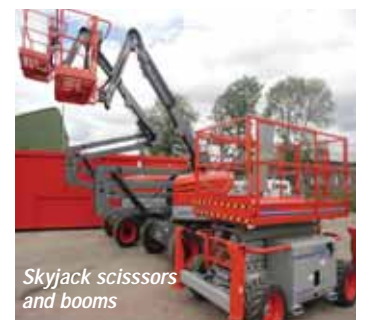
Skyjack scissors and booms

Skyjack will have a full spread of its booms and scissors on show, including the 66ft SJ66T telescopic boom and 32ft 6832RT compact RT Scissor lift along with the final production version of its 12ft self-propelled lift the SJ12 Mini-Mast - definitely worth a look.