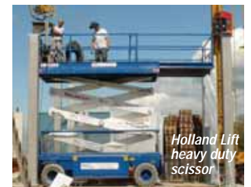
Holland Lift heavy duty scissor

Russon is the UK distributor for Holland Lift and will show a number of the heavy duty scissor lifts, including at least one model from its new Ecostar high-narrow ranges. The company will also show its manually powered Power Scissor and Power Step.