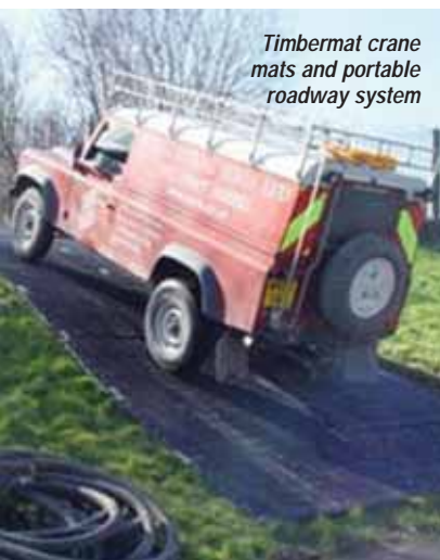
Timbermat crane mats and portable roadway system

Timbermat: Stand 160 Timbermat will have a selection of its heavy duty crane mats along with its Reco-Trac recycled portable roadway system.