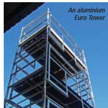
An aluminium Euro Tower

Euro Towers manufactures a wide variety of aluminium access equipment for both commercial and domestic use. It will show its new advanced guardrail podium platform and collective fall protection at low level, in addition to some of its mobile towers, which include: 3T, Advanced Guardrail, Narrow rung and Stairwell access towers. The company will also be presenting the PASMA and IPAF courses that it offers through its training centre.