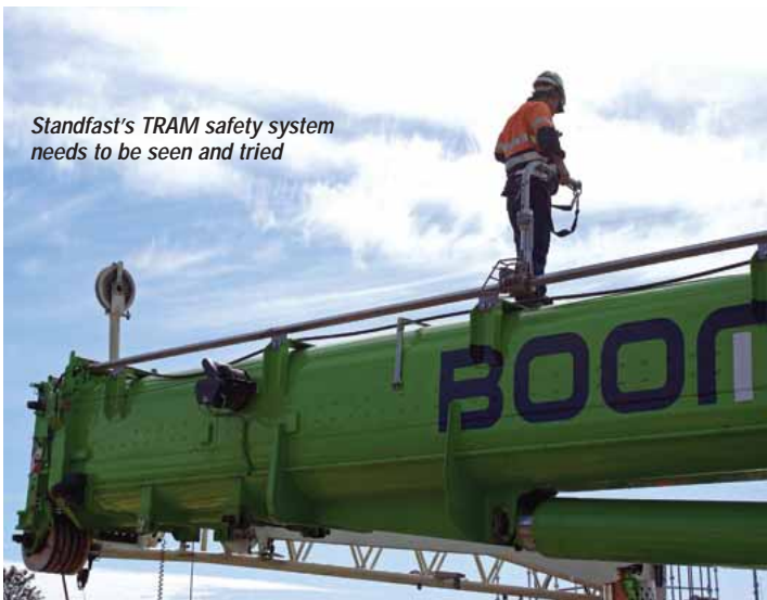
Standfast's TRAM safety system needs to be seen and tried

the top of the tank. After a series of pilot installations on mobile cranes, the product has been fine-tuned for use on both telescopic and lattice boom cranes.