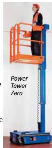
Power Tower Zero

Power Tower will show its latest product additions, including the extensions to its Nano SP range now available in simple no extension 'Zero' format or with the one metre two stage extension, the Nano SP Plus. Also check out the improved Power Tower heavy duty push around lift.