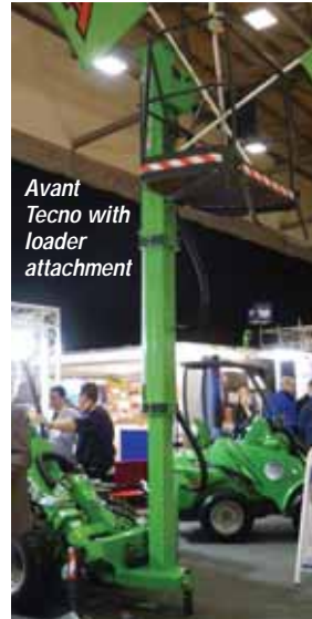
Avant Tecno with loader attachment

Avant Tecno will show a range of its Leguan work platforms, including the 16 metre Leguan 160 and 12 metre 125 low weight self-propelled platforms. The company will also show its Avant loader with Leguan 50 platform attachment.