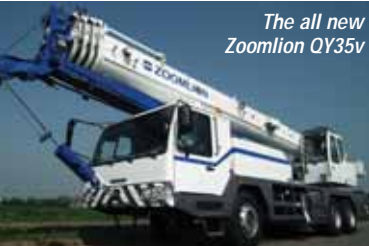
The all new Zoomlion QY35v

Crowland Cranes: Stand 150 When it comes to cranes this is a stand not to miss. Any crane hirer will want – no needs - to stop and take a good look at the new 35 tonne Zoomlion QY35v, the three axle truck crane that takes up where Kato left off. While built by Zoomlion in China the QY35v is the culmination of years of hard work and perseverance on the part of UK/Ireland distributor Crowland cranes which has included experience gained on previous Zoomlion truck cranes sold in the UK. The company will also have the very latest 55 tonne QRT55 Rough Terrain