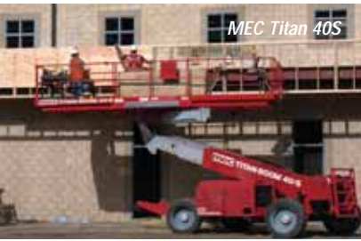
MEC Titan 40S

MEC: Stand 133 MEC, represented by Riwal, will show the highly original award winning Titan 40 boom with a scissor sized platform and telehandler size lift capacity. This is the UK debut and must be seen. Also on show will be the MEC Speed Level, available with battery power.