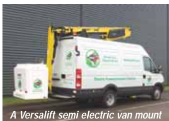
A Versalift semi electric van mount

Versalift is the UK market leader for van mounted aerial lifts. Part of the Time Manufacturing group, the company has been spearheading the move towards more carbon efficient and environmentally friendly lifts and will show some of the fruits of its labours at the show including its 11 metre Semi Electric ET36LF on a Daily SOC 15 van. The company will also show the VST40i on Mercedes Atego, ET46LFZ on 10tonne Man, T3100i on Mercedes Vario 4 x 4 and the pick-up based LT23TB on Mazda Pick Up.