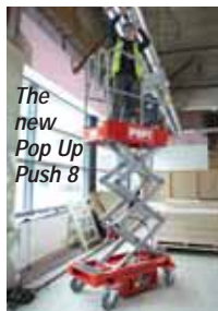
The new Pop Up Push 8

The Pop Up brand, so well known for its push around scissor lift model, is now applied to the company's range of towers, podiums and self-propelled lifts such as the Drive series, including the Drive 12.