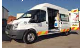
See Highland Access on Stand 117

Highland Access will share a stand with Aldercote and will be highlighting its wide range of training courses covering loader cranes, safe ladder use, powered access operation and manual handling.