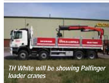
TH White will be showing Palfinger loader cranes