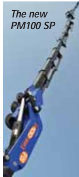
The new PM100 SP

PM will show a PM 50025P part of its Gold series and one of its best-selling cranes in the UK, equipped with radio remote control with all the latest electronic components and security devices in accordance with the latest EN12999 standards. This crane is adapted to work in a variety of different industries and environments. Mounted on a MAN TGS 26360 Drawbar combination, it is one of 43 units supplied by Bickford Truck Hire to the Elliott Group. The company will also show the new PM100 SP.