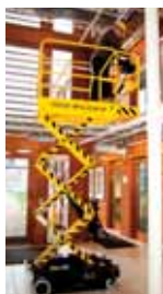
The new Youngman Boss X3X SP

Youngman probably wins the award for most diversity with its push around and self-propelled lifts, podiums, ladders and scaffolds. The company has its brand new anti-surf podium product on show along with the new 5.1 metre working height Boss X3X SP self-propelled micro scissor which is now ready to ship. You should also take a look at its new BoSS Cam-Lock Advance Guardrail (AGR) system designed for its mobile tower range.