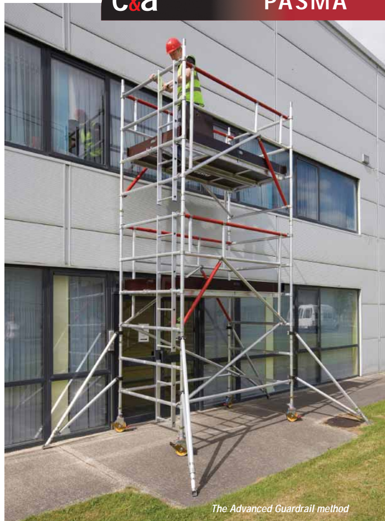
The Advanced Guardrail method

implications of the review, the PASMA training committee has concluded that current PASMA cardholders do not have to re-train until their card has expired at the end of the normal five year period. It decided that the content of the current PASMA training course is sufficient to provide an acceptable working knowledge of the AGR process.