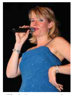
"Why don't you come up and see me sometime