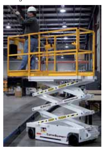
The new Hybrid 1430 from Custom

In terms of telehandlers, MEC is claiming substantial sales in the 12 months since it purchased the designs from Volvo. So far all of its sales have been the low boom European style models, rather than the high boom versions.