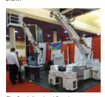
The Omni-directional Brandon crane/platform.

The number of mini cranes on show grows each year, as do the spider lifts. The most interesting new product this time came from specials producer Bailey Specialty Cranes and Aerials and its 'omni directional' version of its Brandon self-propelled mini crane, which now offers a range of attachments including an integrated work platform. The crane/platform's four wheels are turned via a worm drive mechanism on each wheel allowing all four wheels to turn more than 90 degrees to permit pure sideways movement or turning on the spot. While the above covers the major new product introductions, there was plenty more to see, here are a few glimpses of the rest of the show.