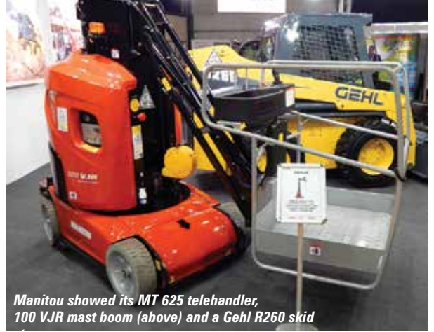
Manitou showed its MT 625 telehandler, 100 VJR mast boom (above) and a Gehl R260 skid