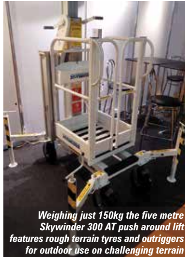
Weighing just 150kg the five metre Skywinder 300 AT push around lift features rough terrain tyres and outriggers for outdoor use on challenging terrain