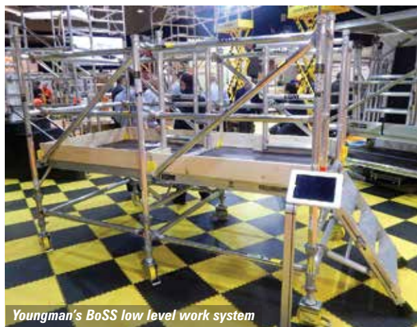
Youngman's BoSS low level work system