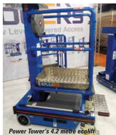
Power Tower's 4.2 metre ecolift