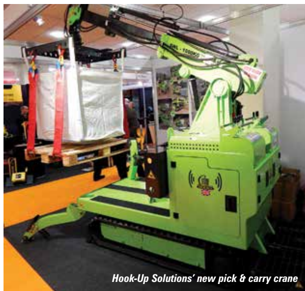
Hook-Up Solutions' new pick & carry crane

Next year's show - its 10th - will be held 10th-11th February in the Ricoh Arena, Coventry