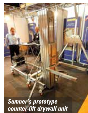
Sumner's prototype counter-lift drywall unit