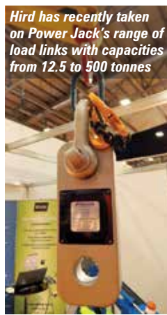
Hird has recently taken on Power Jack's range of load links with capacities from 12.5 to 500 tonnes