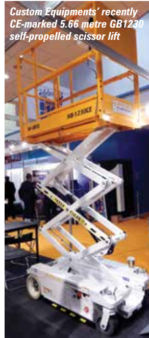
Custom Equipments' recently CE-marked 5.66 metre GB1230 self-propelled scissor lift