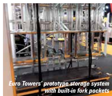
Euro Towers' prototype storage system with built-in fork pockets