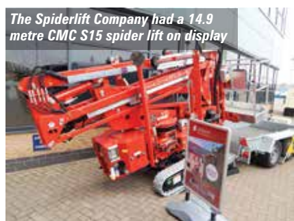
The Spiderlift Company had a 14.9 metre CMC S15 spider lift on display