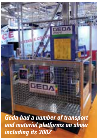
Geda had a number of transport and material platforms on show including its 300Z