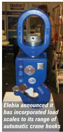
Elebia announced it has incorporated load scales to its range of automatic crane hooks