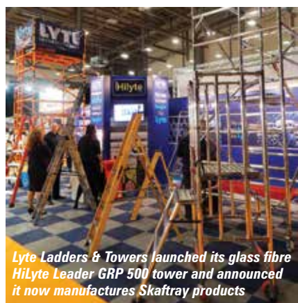
Lyte Ladders & Towers launched its glass fibre HiLyte Leader GRP 500 tower and announced it now manufactures Skafray products