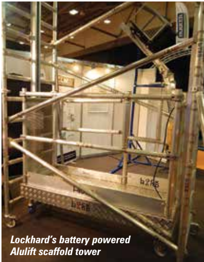
Lockhard's battery powered Alulift scaffold tower