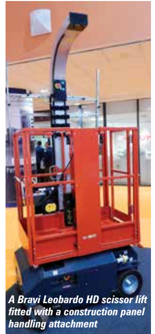
A Bravi Leobardo HD scissor lift fitted with a construction panel handling attachment