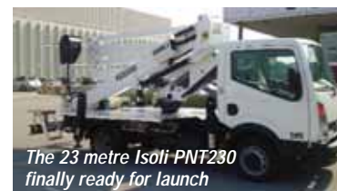
The 23 metre Isoli PNT230 finally ready for launch

The 23 metre Isoli PNT 230 truck mounted lift, which missed Apex this year finally made its debut at SAIE. The new lift is mounted on a short wheelbase 3.5 tonne chassis, with up to 11 metres of outreach from the dual sigma type riser and three section top boom. The outriggers can be left retracted within the overall width of the vehicle, but outreach is then automatically limited to nine metres.