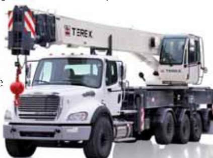
The 40 tonne Terex Crossover 4500

Terex launched the 40 tonne/45 ton Crossover 4500 at the ICUEE show in Kentucky earlier this month. The new crane's bottom half is clearly related to the company's 60 ton Crossover 6000 with three position swing-out X-pattern outriggers and 360 degree load chart. The superstructure comes from the 40 ton Terex T340-1XL telescopic truck crane with its four-section 32 metre main boom and two swingaway extension options, a 9.8 metre fixed length or 9.8 to 14.9 metre extendable, both with 15 or 30-degree offsets.