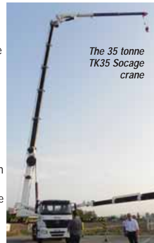
The 35 tonne TK35 Socage crane

The new TJ and TJJ models will offer up to 600kg platform capacity with a 500 kg hoist option and/or the option of replacing the platform with a 900kg hoist for occasional crane work. The company also showed its 35 tonne commercially mounted truck crane based on the MG35TK built by MGI, which is owned by Socage partner Fiorenzo Flisi.