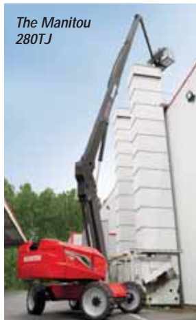
The Manitou 280TJ

Manitou unveiled two new articulated/telescopic booms at Apex last month with 79 and 85ft platform heights. The new models, the 260TJ and 280TJ are variants of the same base unit and both use a short single stage riser and three section telescopic boom. But while the 26 has a regular fixed length articulated jib, the 28 employs a two section telescopic jib similar to that introduced on the Haulotte H28TJ+ and more recently the JLG 1500SJ.