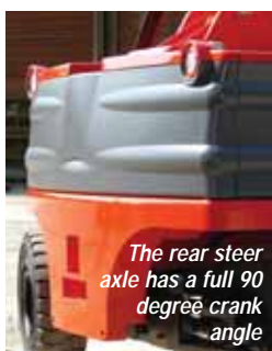
The rear steer axle has a full 90 degree crank angle