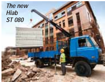
The new Hiab ST 080

Cargotec has announced a small telescopic boom loader crane for emerging markets with a 3,200kg maximum capacity. The Hiab ST 080 light weight crane uses Hiab's hexagonal profile boom sections and is available with two or three telescopic extensions. The two extension ST 083-032 has a horizontal reach of 7.8 metres, while the three extension ST 084-032 offers 10.1 metres. The ST080 is said to be ideal for light trucks due to its compact dimensions. The hoist mechanism includes a large drum for rope storage and high speeds for quick operation.