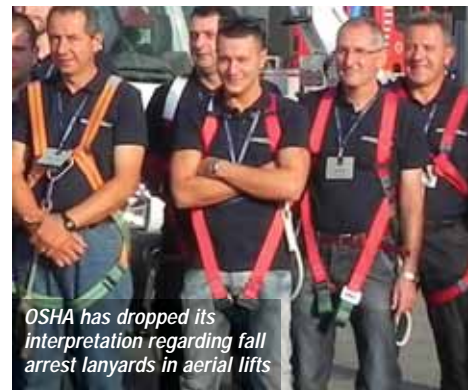
OSHA has dropped its interpretation regarding fall arrest lanyards in aerial lifts

The US health and safety administration OSHA has rescinded its Jan 2009 letter of interpretation on the use of shock absorbing lanyards on aerial work platforms. The letter created uncertainty in the industry by suggesting that a requirement for a minimum anchorage height of 18.5ft /5.6 metres would prevent the use of a fall protection system (six foot lanyard with shock absorber and full body harness) in an aerial lift. For further details go to http://www.vertical.net/en/news/story/13287