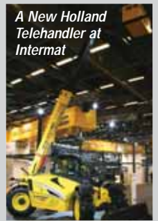
A New Holland Telehandler at Intermat

New Holland has announced that from 2012 its North American business will focus on compact equipment and in doing so will withdraw its heavy products, including telehandlers from the North American market.