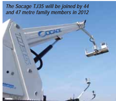
The Socage TJ35 will be joined by 44 and 47 metre family members in 2012

The new models are an interesting combination in terms of specification. The fact that they are articulated makes them more compact than equivalent straight telescopics and yet due to the short length of the riser, outreach is greater than an articulated boom lift. With both jibs able to 'tuck under' overall lengths can be reduced to around eight metres. The new machines are solid performers with a specification that is intended to appeal to a wide range of general users.