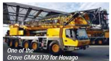
One of the Grove GMK5170 for Hovago

Established in 1946, Hovago runs a regular crane fleet in Holland, but also rents cranes on various terms all over the world, often through local or other international rental companies.