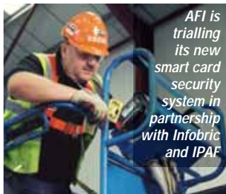
AFI is trialling its new smart card security system in partnership with Infobric and IPAF

The International Powered Access Federation (IPAF) has also been working with AFI on the launch of the system and operators who are authorised by site managers for particular machines will be given prototypes of IPAF's smart PAL Card containing their details. To unlock the machine, the operator swipes the card across an Infobric unit mounted near the control box. In a further safety measure, there is a customer option for the machine still not to unlock until the operator has confirmed that he has carried out pre-use inspection checks. The security system has no effect on the lower controls or other safety systems. A number of the card readers have been fitted to aerial lifts working on the construction of the catering village at the Carillion Media Hub in London and reaction from contractors on site has so far been highly positive.