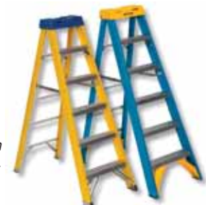
Werner launches in the UK on November 1st.