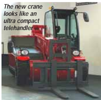
The new crane looks like an ultra compact telehandler

What makes this different from other cranes with fork attachments are its overall dimensions at 3.3 metres long by 1.73 metres wide with an overall height of two metres and more importantly its low boom pivot point, making it very similar to many ultra compact telehandlers, but with a lot more muscle. The turning circle is exceptionally tight with true 90 degree crank angle steering on the rear axle. Drive is direct via twin AC electric motors on the front axle that also counter rotate to help improve the turning circle and reduce stress build-up during sharp turns. A separate AC motor drives the crane hydraulics.