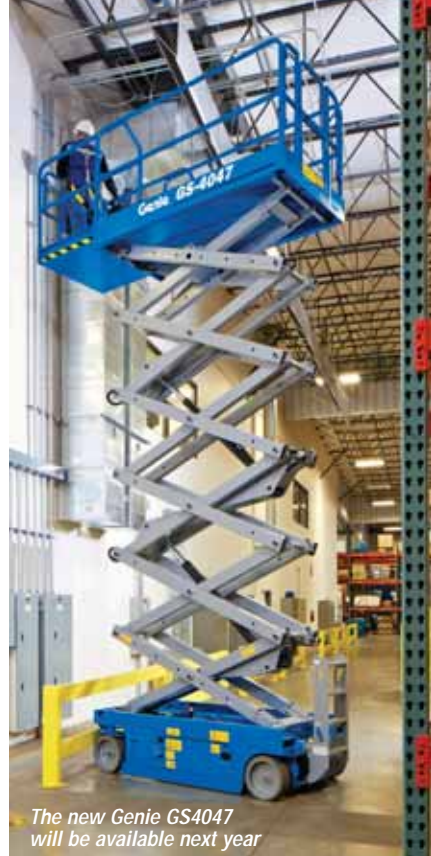
The new Genie GS4047 will be available next year

The new Genie, which will be built in the UK and ship in the first quarter of next year, looks like a solid contender, although in our quick side by side comparison it does not particularly excel in any one area. No matter, it has a first rate across the board performance, matching the most serious contenders in all areas apart from Iteco's long deck extension. Where it will score is with the Genie brand awareness, distribution, product support etc... and with neither JLG nor Skyjack in the sector it could clean up. The comparison did