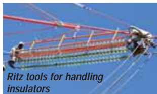
Ritz tools for handling insulators

Terex Utilities has acquired a controlling interest in Betim-based Ritz do Brasil S.A. a producer of aerial lifts and a wide range of other equipment for live line work up to 800kV. Founded in 1960, it employs around 700 staff and already exports its tools and solutions for live line work to more than 60 countries. The company entered the live line tool market in and the insulated aerial lift business in 1982, becoming a Terex Utilities distributor last November.