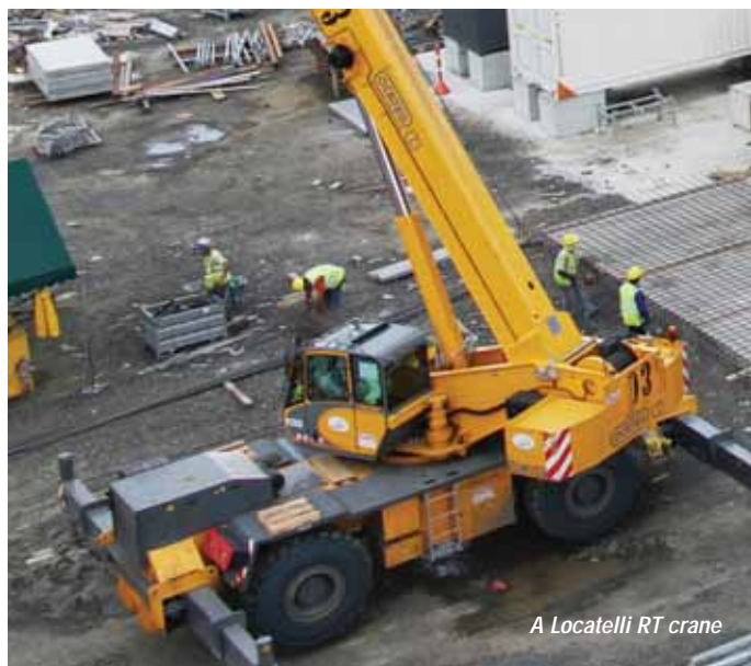
A Locatelli RT crane