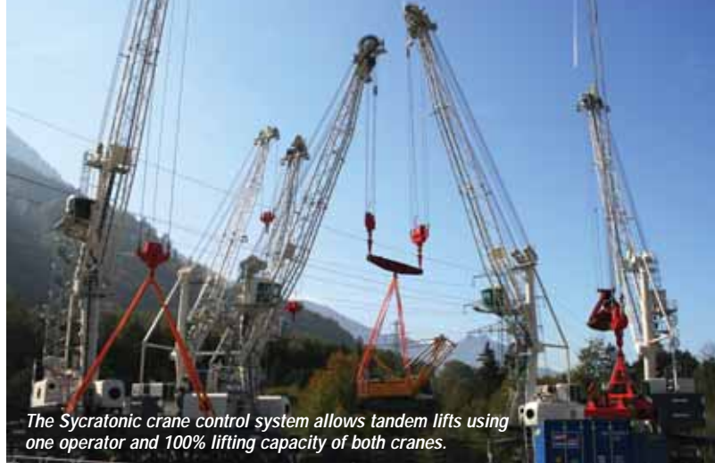
The Sycratonic crane control system allows tandem lifts using one operator and 100% lifting capacity of both cranes.