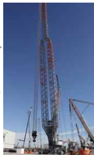
Liebherr's Power Boom.

Liebherr has unveiled its 'Power Boom' the simple concept consists of two adapters - upper and lower - that convert the company's 3,000 tonne LR113000 and 1,350 tonne LR11350 crawler cranes from single boom units to partial twin boom designs, increasing some long boom lift capacities by around 50 percent. See crawler cranes for more details.