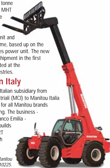
The new top of the range Manitou MHT10225.

Manitou has renamed its Italian subsidiary from Manitou Costruzioni Industriali (MCI) to Manitou Italia which is now responsible for all Manitou brands including Gehl and Mustang. The business - headquartered in Castelfranco Emilia - employs 250 people and builds Manitou's 360 degree MRT telehandlers and MHT high capacity models.