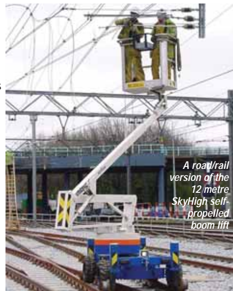
A road/rail version of the 12 metre SkyHigh self-propelled boom lift

SkyHigh is a long established company that dates back to the 1980's when its corporate name was Etramo. The company's 12 metre self-propelled lift closely resembled the Nifty Height Rider but never managed to achieve its success. The company also mounted the superstructure on a pick-up truck and in recent years has had success with niche rail mounted versions and ATEX explosion proof models.