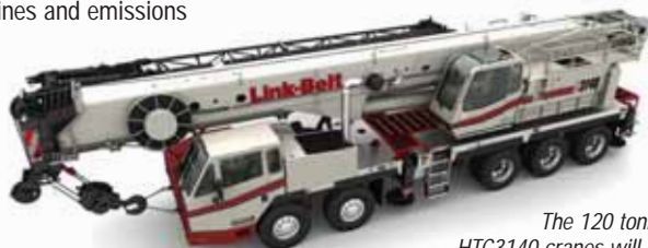
The 120 tonne HTC3140 cranes will be updated for 2012.