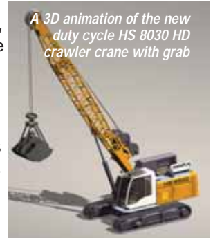
A 3D animation of the new duty cycle HS 8030 HD crawler crane with grab

Liebherr's crane, maritime cargo handling and foundation machinery facility in Nenzing, Austria celebrated its 35th anniversary at the end of September. 600 customers and employees from all over the world joined Nenzing staff and Liebherr family members for the celebrations which included a tour of the new production Hall 8 which now makes the booms for HD duty cycle crawler cranes.