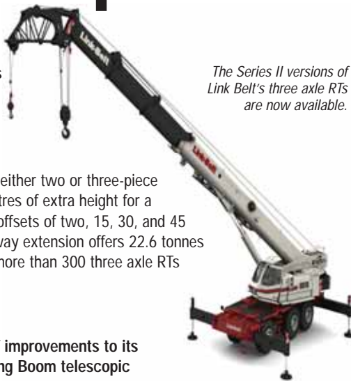
The Series II versions of Link Belt's three axle RTs are now available.

They include the latest Cummins engines and emissions technology, Eaton UltraShift Plus transmission, Link-Belt's Pulse crane operating system redesigned cabs with new gauges and revised control placement and new outrigger operation with self-levelling.