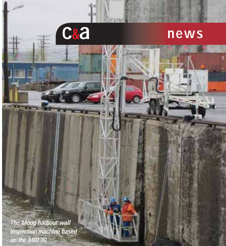
The Moog harbour wall inspection machine based on the MBI 70