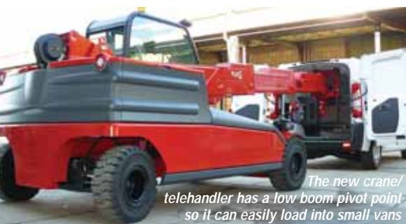
The new crane/telehandler has a low boom pivot point so it can easily load into small vans