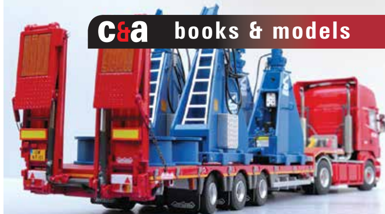
The parts as a haulage load