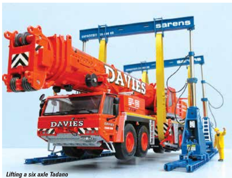
Lifting a six axle Tadano