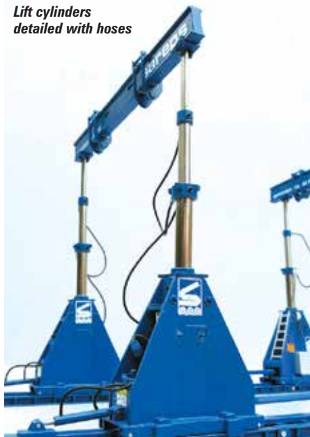
Lift cylinders detailed with hoses