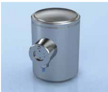
LCM Systems' ATEX-certified load cell, load pin and load link