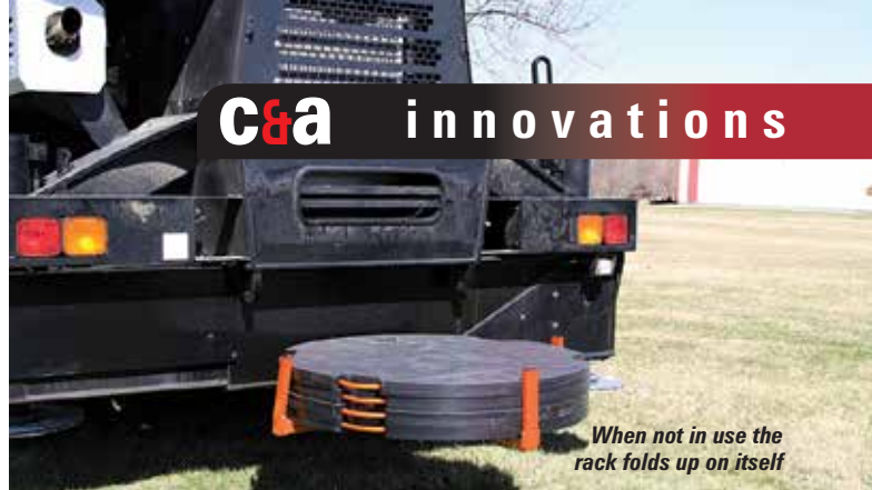
When not in use the rack folds up on itself