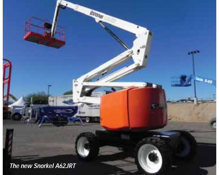
The new Snorkel A62JRT

still greater than its competitors. The new boom lift uses the same Polaris chassis as the 62ft A62JRT and is also common to the company's 40/46ft booms.