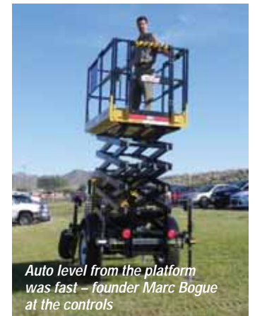
Auto level from the platform was fast - founder Marc Bogue at the controls

Skyjack was out in force demonstrating its 66ft straight boom - the SJ66T - spec for spec one of the best products in its class, particularly in terms of gradeability and turning circle.