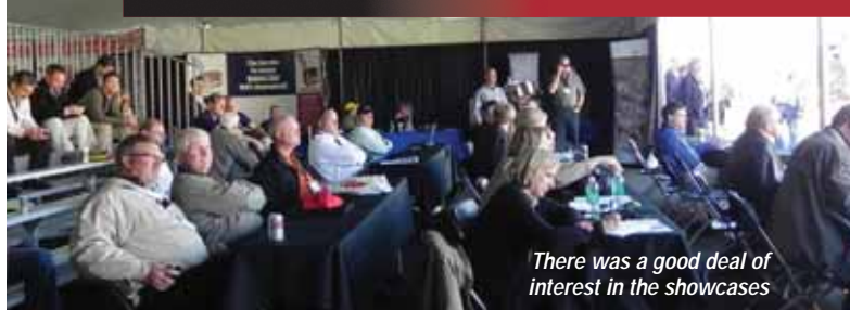
There was a good deal of interest in the showcases

comparable product range is that of JLG, with its 69LE line. MEC has also been a pioneer in the sector and has two strong products which offer the option of four wheel drive. While the platform heights are different at 30 and 37ft, they certainly offer a strong alternative. However the new Genie DC models will give JLG a good 'run for its money' and are likely to provide a strong boost to the sector. Apart from drive at full height, lower weight, lower stowed height and a longer extended deck the key feature on the Genie is its modern direct 48 volt AC electric wheel drive system. Driving the rear axle the motors are totally sealed, to the point that they do not require covers. The new scissors are very stable in terms of platform rigidity, exceptionally easy to service and boast far smoother controls than IC equivalents. The platform is a good size, especially when extended, but sadly the 1.5 metre deck extension of the ANSI models will be blocked at 1.17 metres on CE models. The single joystick operates the drive and steer only, a separate switch with two speed option controls the lift function.