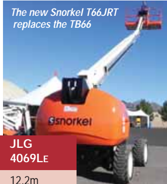
The new Snorkel T66JRT replaces the TB66

The company says that at 1.37 metres, the T66JRT offers by far the best inside turning radius of any two-wheel steer boom in its class. The unit is also compact with an 8.5 metre overall length and 2.5 metres overall height.