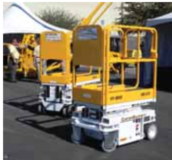
Custom Equipment with its 8 and 10ft low level self-propelled scissor lifts.