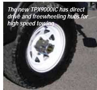
The new TPX9000IC has direct drive and freewheeling hubs for high speed towing

height, direct drive self-propelled version of its TPX9000 trailer scissor. Until now the TPX has been battery powered and more recently self-propelled via a friction drive. The new IC unit uses a Subaru petrol engine - although a diesel will also be offered, hopefully one that is quieter than the Subaru - and drives the wheels through the trailer axle. The unit is very solid and is