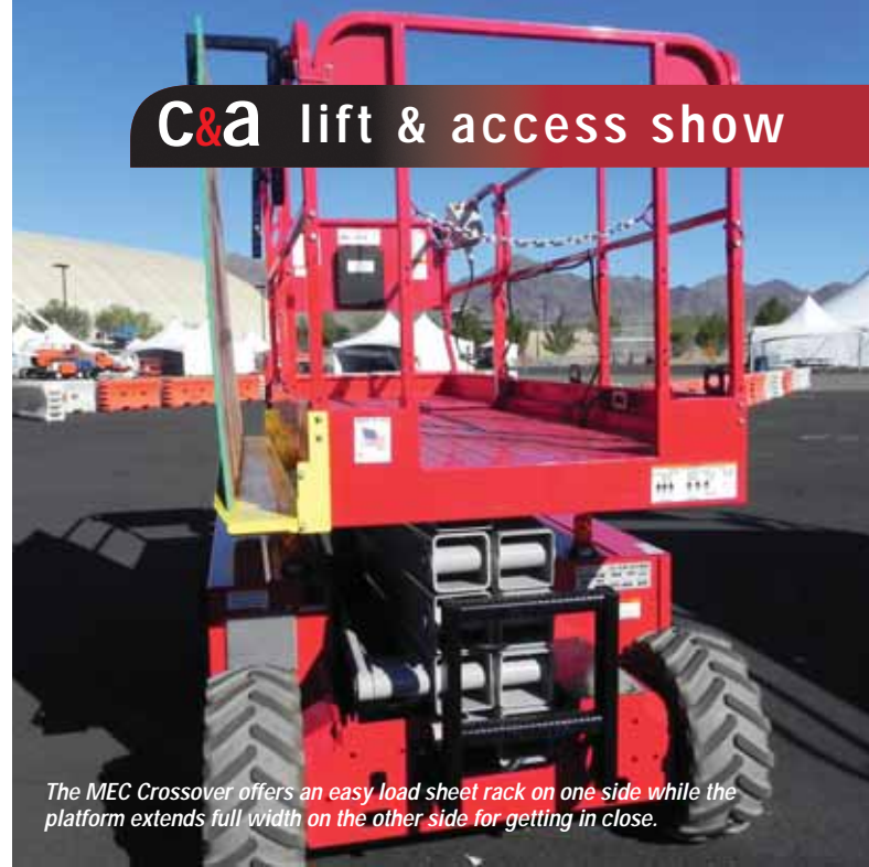
The MEC Crossover offers an easy load sheet rack on one side while the platform extends full width on the other side for getting in close.