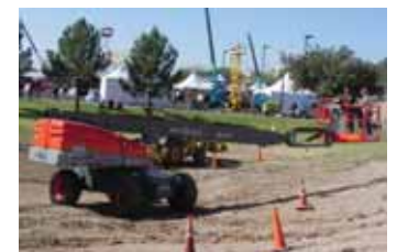
The Skyjack SJ66T is put through its paces on the RT track

Skyjack was out in force demonstrating its 66ft straight boom - the SJ66T - spec for spec one of the best products in its class, particularly in terms of gradeability and turning circle.