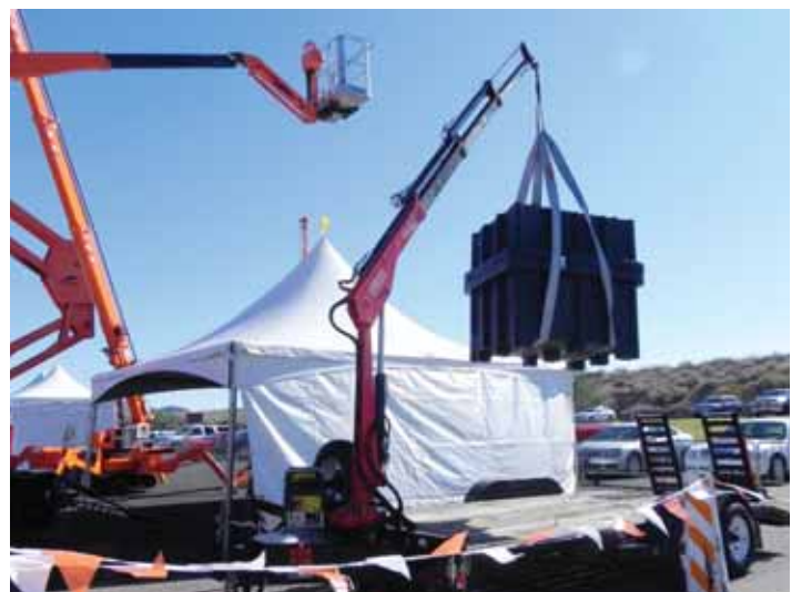
Fascal now represents Jekko as well as Fassi, it has had some success with this trailer mounted crane