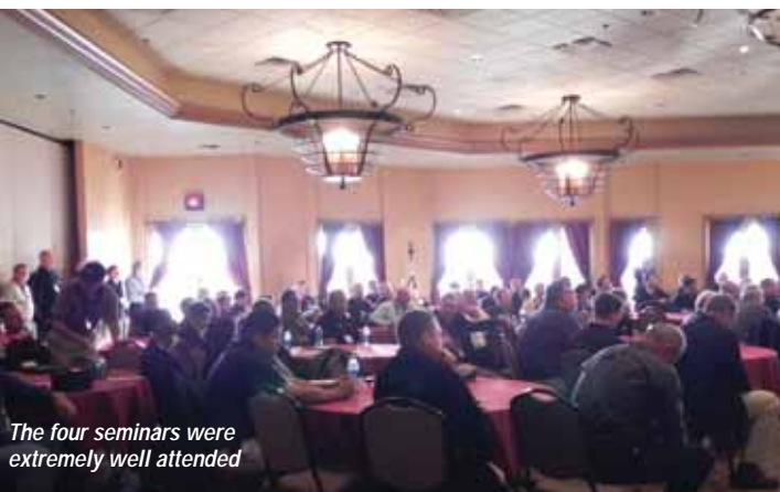
The four seminars were extremely well attended

This year a conference was added, while the Showcase was expanded into more of a specialist exhibition. In the past only manufacturers entering equipment into the 'Rodeo' and a few component suppliers were invited, but this year the expanded event included rental companies and other interested parties. Held at West World on the north side of Scottsdale, Arizona the idea was to provide time for manufacturers to present their equipment to visitors and component suppliers, with plenty of space to demonstrate on both slab and rough terrain, attend the informative seminars and in between, be an exhibition. The first two elements worked really well, but the numbers attending - around 250 over the two days - made it a little lean as a trade show, even a specialised trade show.