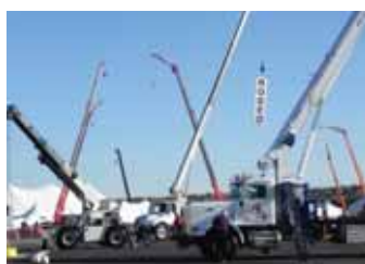
The crane Rodeo area including models from Shuttlelift (Manitowoc), Manitex and Elliot.