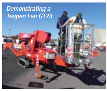
Demonstrating a Teupen Leo GT23