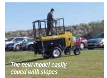
The new model easily coped with slopes

completely self-levelling and fast. The company has CE approval for the new machine and is looking for European dealers.