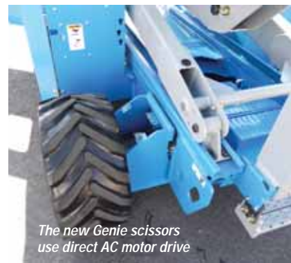
The new Genie scissors use direct AC motor drive

comparable product range is that of JLG, with its 69LE line. MEC has also been a pioneer in the sector and has two strong products which offer the option of four wheel drive. While the platform heights are different at 30 and 37ft, they certainly offer a strong alternative. However the new Genie DC models will give JLG a good 'run for its money' and are likely to provide a strong boost to the sector. Apart from drive at full height, lower weight, lower stowed height and a longer extended deck the key feature on the Genie is its modern direct 48 volt AC electric wheel drive system. Driving the rear axle the motors are totally sealed, to the point that they do not require covers. The new scissors are very stable in terms of platform rigidity, exceptionally easy to service and boast far smoother controls than IC equivalents. The platform is a good size, especially when extended, but sadly the 1.5 metre deck extension of the ANSI models will be blocked at 1.17 metres on CE models. The single joystick operates the drive and steer only, a separate switch with two speed option controls the lift function.