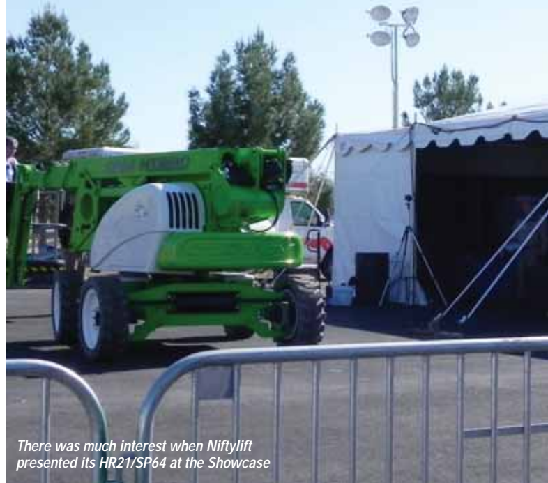
There was much interest when Niftylift presented its HR21/SP64 at the Showcase

Spider cranes were well represented with Maeda, Unic and Jekko all out in force. It seems that more access rental companies are