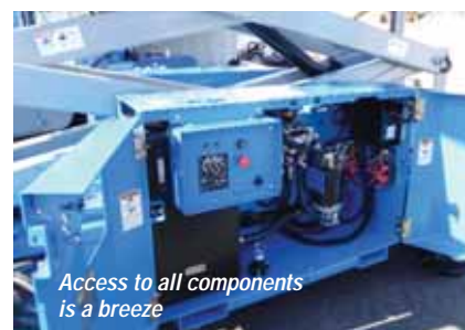
Access to all components is a breeze