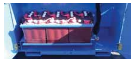
The 26 and 33ft models have an eight unit 350AH battery pack as standard, the 40 has 370AH batteries which are available as an option on the 26 and 33