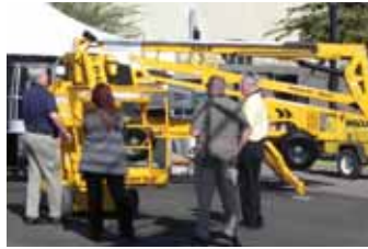
Haulotte showed its Bil-Jax 45XA All Terrain boom, a Star mast boom and compact scissor lift.

JLG put its M600JP electric/bi-energy powered 60ft boom lift into the showcase in order to show off something a little different. It also showed its full size and compact telehandlers in the showcase walk arounds as well as bringing along one of its Hinowa-badged spider lifts.