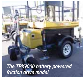
The TPX9000 battery powered friction drive model

Another totally new launch at the show was the latest version of what was originally the 24ft PLE trailer scissor lift. The company, now known as Innovative Equipment, has continued to refine its products which now have excellent build quality and a far more rugged design. New for the show was the TPX 9000 IC, a 23ft (7m) platform