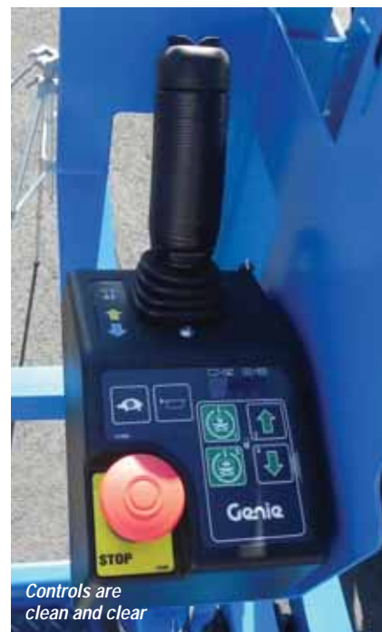
Controls are clean and clear