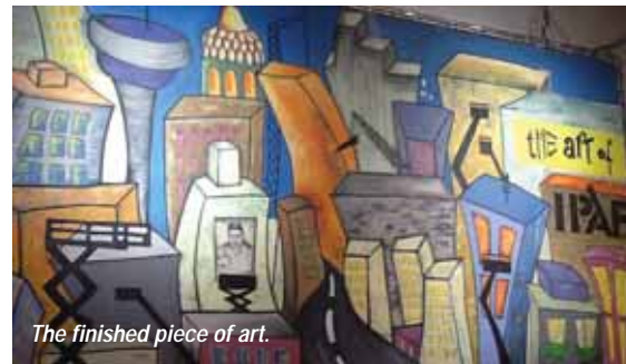
The finished piece of art.

Visitors to the recent A+A health and safety exhibition in Düsseldorf were drawn to IPAF's stand with its unique combination of creativity and safety.