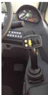
The single lever, electro-hydraulic joystick has been redesigned to include the 'up and down' transmission control buttons.

Caterpillar has launched four new C Series telehandlers - the Cat TH336C, TH337C, TH406C and TH407C- with capacities up to 3,700kg and lift heights to 7.3 metres. All four models feature two section booms and Cat stage IIIB C4.4 engines, with improved fuel economy and lower operating costs. They are aimed at the agriculture, construction and industrial markets. The 336 and 337 have lift capacities of 3,300kg, while the 406 and 407 are rated at 3,700kg. Lift height for the 336 and 406 is 6.1 metres, compared to 7.3 metres on the other two.