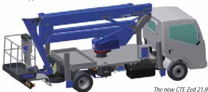
The new CTE Zed 21JH.

The new model also employs CTE's mechanical link 'H' stabilisation system which deploys the beam and outrigger in a single movement, which it says, can cope with level differences, such as pavements/sidewalks of up to 220mm. While the fully deployed outriggers do not fall within the machine's overall width, the total footprint is just less than three metres. All hoses and cables are internal, while a new control panel is said to make operation easier, improves visibility and has a protective cover. The new unit will make its first appearance on the IPAF stand at Intermat.