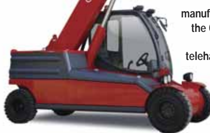
The Galizia GF60

Italian pick & carry crane manufacturer Galizia has launched the GF60, a new six tonne crane based on its innovative telehandler/crane/platform Multis 636. The GF60 has a longer three section boom, with 7.5 metres under hook height.