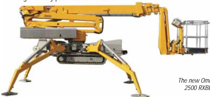
The new Omme 2500 RXBDJ.

The overall shipping length can be reduced to 5.95 metres through a quick-release basket. Overall width is 1.1 metres and total weight 3,950kg. The working footprint is 3.75 metres and tail-swing is always zero. The new lift is powered by a Kubota diesel for outdoor use and includes a 200Ah battery pack for indoor or sensitive outdoor applications. A purely battery powered model with larger battery pack is also available.