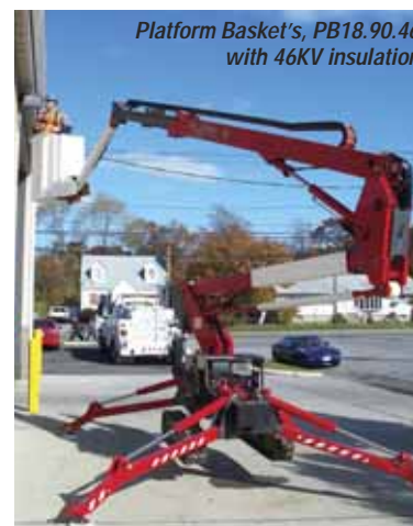
Platform Basket's, PB18.90.46 with 46KV insulation

Major updates have also been made to the 15 and 18 metre models - the 15.75 PRO and 18.90 PRO - which now feature Kubota diesel engines, offering more power and lower noise levels, automatic outrigger set up and levelling, a more accurate load limiting device which enhances the working envelope, improved electrics and drive system together with dual speed hydraulic motors for greater productivity. Battery and Bi-Energy versions are also available.