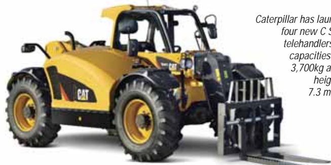
Caterpillar has launched four new C Series telehandlers with capacities up to 3,700kg and lift heights to 7.3 metres.

Other features include a new Cat powershift transmission with six forward and three reverse speeds, a 40kph road speed. A redesigned engine cooling package with hydraulic reversing fan, improved visibility from the cab thanks to a larger glazed area and new curved engine cover. Single lever, electro-hydraulic joystick incorporating transmission control buttons and a torque regulated load sensing hydraulic pump with increased flow of 150 litres a minute.