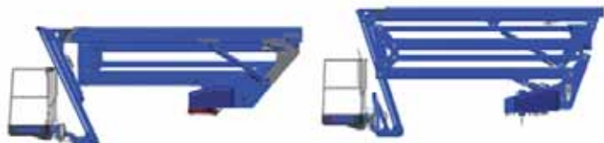
The linkage has been completely revised.