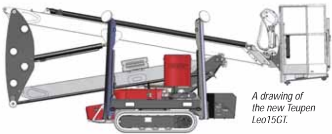
A drawing of the new Teupen Leo15GT.