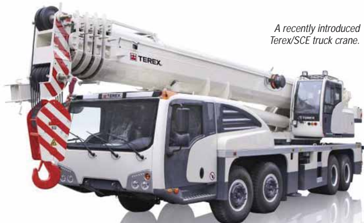
A recently introduced Terex/SCE truck crane.

Sinomach is a wholly-owned subsidiary of China National Machinery Industry Corporation and specialises in restructuring and integrating engineering machinery businesses under the China National Machinery Industry Corporation.