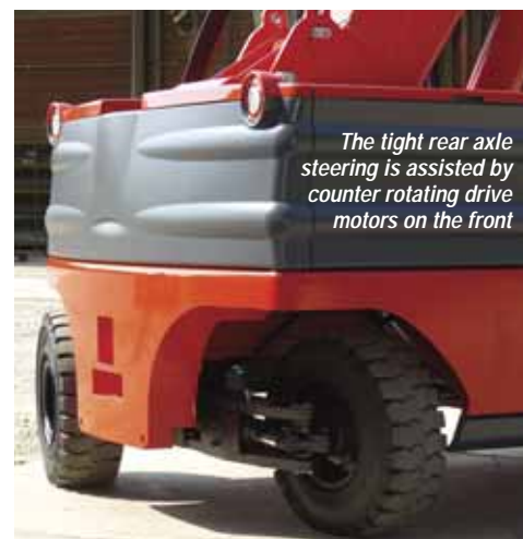
The tight rear axle steering is assisted by counter rotating drive motors on the front

The company said a number of customers wanted the advantages of the Multis' ultra tight turning circle with regular axle, compact dimensions, twin AC motor drive and low boom pivot point etc, but in the format of a dedicated crane, with a little more reach. The Multis 636 has a six metre boom, which is a little short compared to the latest models from JMG and Ormig.