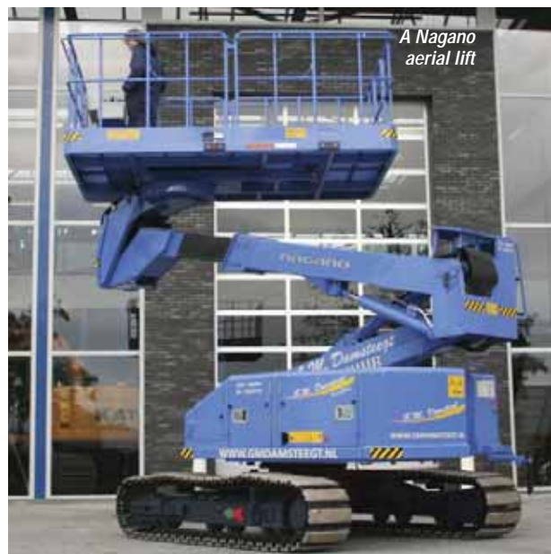
A Nagano aerial lift

Chinese equipment manufacturer Beijing Jingcheng Heavy Industry (JCHI) has acquired Japanese construction and aerial lift manufacturer Nagano for just over a billion yen ($13.3 million/€10 million). JCHI is a subsidiary of Beijing Jingcheng Mechanical and Electrical Holding Company - part of the Beijing Municipal Government - and produces a full range of self-propelled aerial lifts which it markets under the JCHI brand. Nagano's main products include mini-excavators, aerial work platforms and crawler cranes which it sells under the Nagano and Hanix brands. Nagano filed a restructuring application with Nagano district bankruptcy court in May 2011. JCHI succeeded in acquiring the business after a plan it presented was approved by a majority of creditors and authorised by the district court.