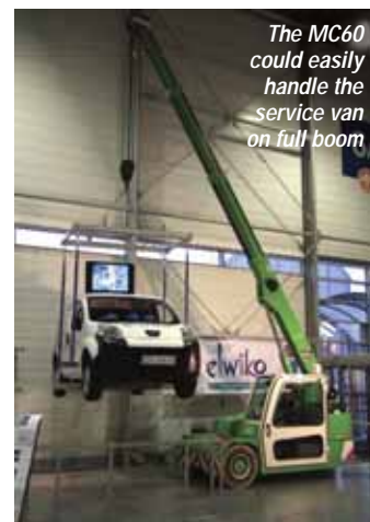
The MC60 could easily handle the service van on full boom

Italian pick & carry crane manufacturer JMG launched its new six tonne MC60 at the recent Poznań fair in Poland. The company exhibited with distributor Elwiko which has purchased the first two units. The MC60 can handle its 6,000kg maximum capacity up to half a metre in front of the crane's front bumper and boasts a four section full power 8.8 metre power boom and up to 5.5 metres of horizontal outreach.