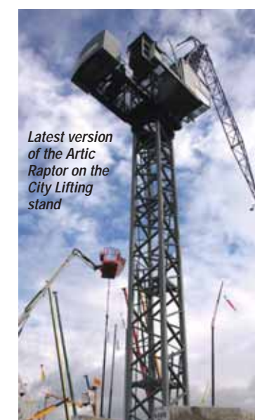
July 2012 cranes & access 53