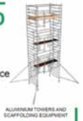
ALUMINIUM TOWERS AND SCAFFOLDING EQUIPMENT