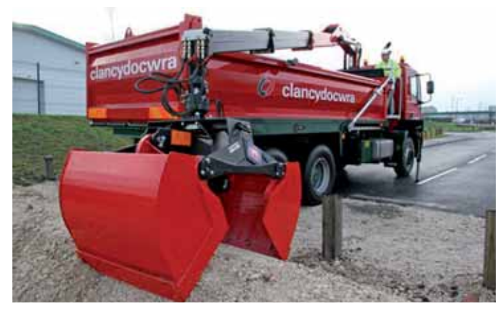
The 500 litre clam shell bucket is the most popular in the UK.

Estimates suggest that more than 50.000 articulated loader cranes were sold worldwide in 2005. Reports suggest that this will increase by around a further seven percent this year and looks set to continue into 2007. The UK and Ireland is an important market possibly taking up to 10 percent of the worldwide total this year.