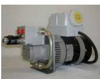
The hydraulic generator powers hand tools and other equipment.

Haulotte is the latest producer to install the company's generators having recently taken delivery of 30 of its 3.5Kva 110v units. This generator is designed to operate in isolation to the functions of