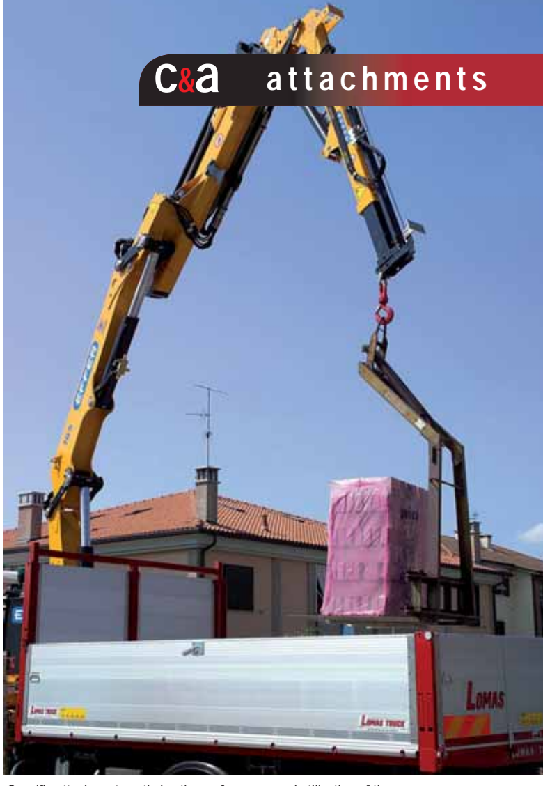
Specific attachments optimise the performance and utilisation of the loader crane as well as improving safety.

All the leading lorry loader manufacturers - Palfinger, Hiab, Fassi and PM - have produced excellent financial results and many are expanding production to meet this increased demand. Even the USA - an area usually preferring straight booms - industry estimates put the knuckle boom market up 50 percent, admittedly from a smallish but still sizeable total. All these factors add up to increased demand and a busy time for attachment suppliers. Major loader crane users in the UK are the national builder's merchants such as Travis Perkins, Jewson and Wolseley which run huge delivery fleets fitted with loader cranes. But whatever the organisation or industry, the main problem for all lorry loader operators is the huge range and variety of products that have to be loaded and unloaded. Even allowing for global standardisation of packs - the result of positive communication between equipment and materials suppliers - there is still a limitless amount of variation.