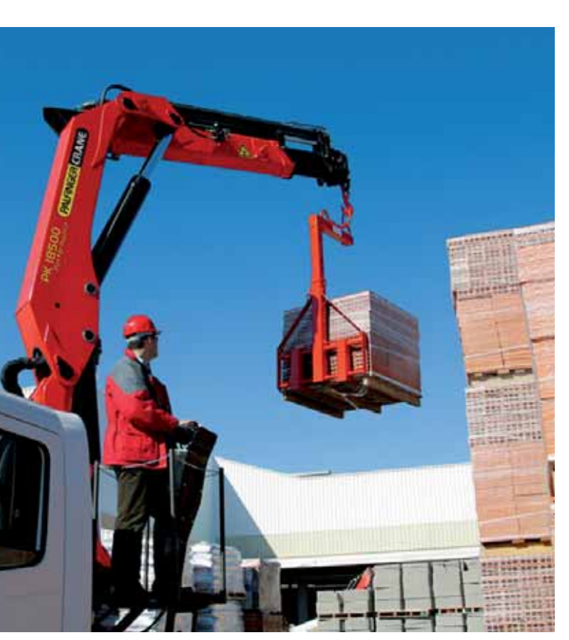
There are many different designs of pallet forks all making loading and unloading much easier.

Kinshofer's current loader crane range covers all common applications as well as the more unusual items such as augers, manipulators - for moving poles, pipes, barrels and even road barriers - as well as special grapples for rail work, rocks, brushwood and refuse materials. The most popular clamshell capacity in the UK is around 500 litres capacity covered by Kinshofer's KM602 which is aimed at heavy-duty soil and rubble collection. The company's range of brick grabs feature a mechanical latch allowing the operator to set the plunge depth to match the size of the stack as well as an automatic clamp pressure boost when the arms are fully retracted. The lighter weight KM331 unit is a compact and budget-priced brick unit with tapered legs for easier access between packs. For paving stones or bricks or any other unit load, the KM401 and KM401H crane forks provide quick loading and unloading with spring supported hydraulically adjustable centre of gravity.